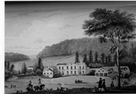
Abb. 85 Joseph Addisons Landsitz in Bilton