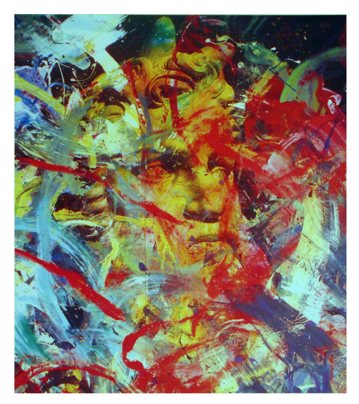
Figure 5.1: This painting from Dietrich Stalmann consists of two different layers. The background layer shows a realistic human face. The foreground layer consists of colored strokes, whose interpretation is difficult for a visual system. No physical objects exist that would give rise to such a constellation of strokes. However, the human visual system can detect them and operate with them, although they are completely new for the system. Thus, the two layers can be seen as representative of top-down methods like the system dynamics approach, which could be applied for tracking the face and bottom-up methods, which are able to perceive and learn unknown shapes an yield first hypotheses for objects.