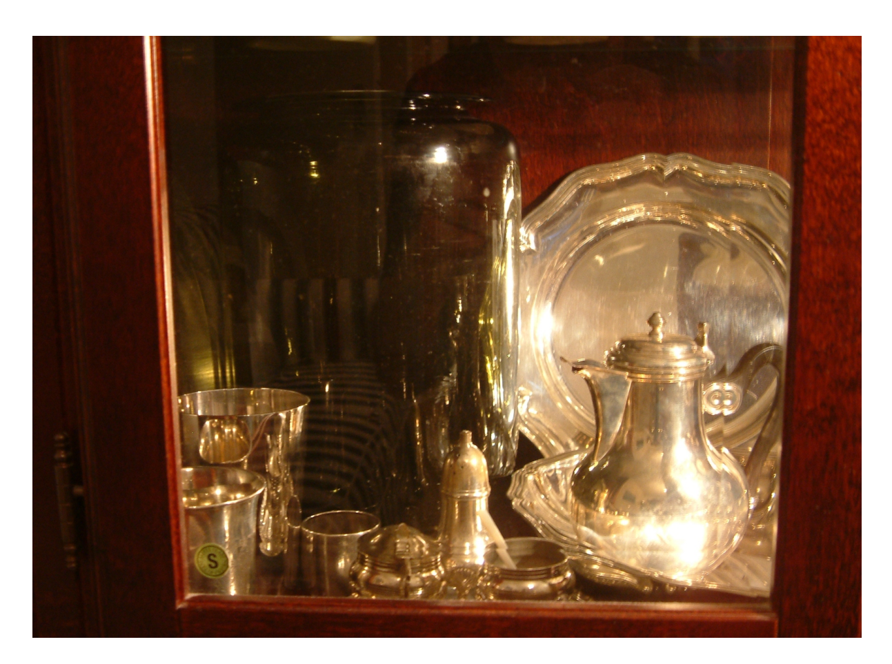
Figure 5.2: Silver objects and a glass vase are viewed through the glass door of a show-case. The striped cover of a sofa in the surroundings of the case is reflected within the glass, its colors blending with colors of the interior objects. At the same time, the silver objects reflect their surroundings, which in total, produces a rich spectrum of visual effects, which are difficult to model and predict.

is viewed. Without going into the details of the model, we look at a summary of the used symbols in table 5.1. As can be seen, a lot of parameters have to be specified, in order to model the reflectance properties of a single point. Moreover, the considered model is just an approximation of the reflectance of real materials, and it describes only a subclass of materials. That is, different models would have to be applied for different materials, which first requires material identification. But even if modeling of the light sources and the surface properties can be achieved, it becomes difficult to predict the appearance of features in real-time. Assume that we want to track the silver cup at the bottom left of figure 5.2, and that we have determined a set of visible features, one of which is the right