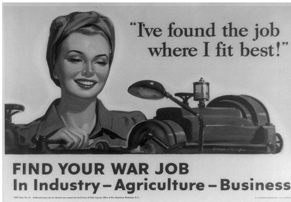
Figure A.1: G. Rapp, "I've found the job where I fit best!": find your job in industry – agriculture – business. (1943). Office of War Information. Poster No. 55.