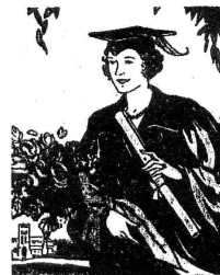
Figure A.7: Los Angeles Unified School District. Flyer advertising McAlister campuses for pregnant teenage students.