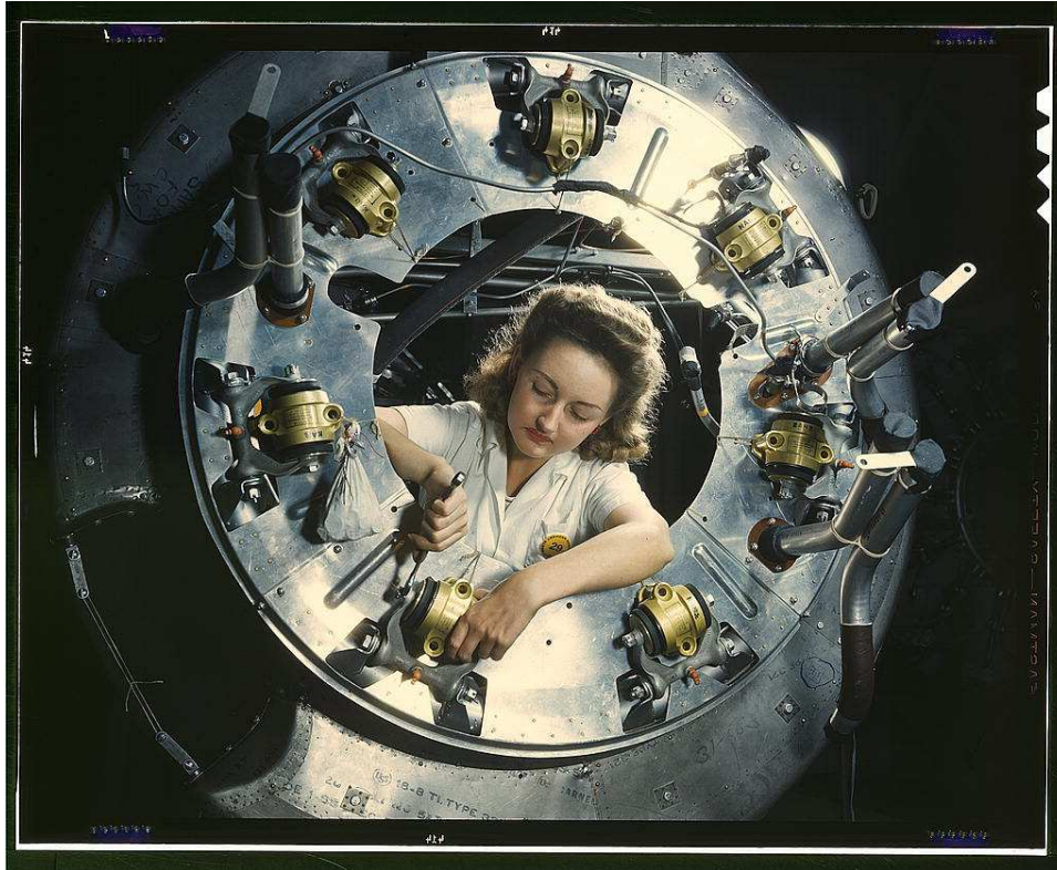
Figure A.3: “Part of the cowling for one of the motors for a B-25 bomber is assembled in the engine department of North American [Aviation Inc.]’s Inglewood, Calif., plant.” (October 1942).