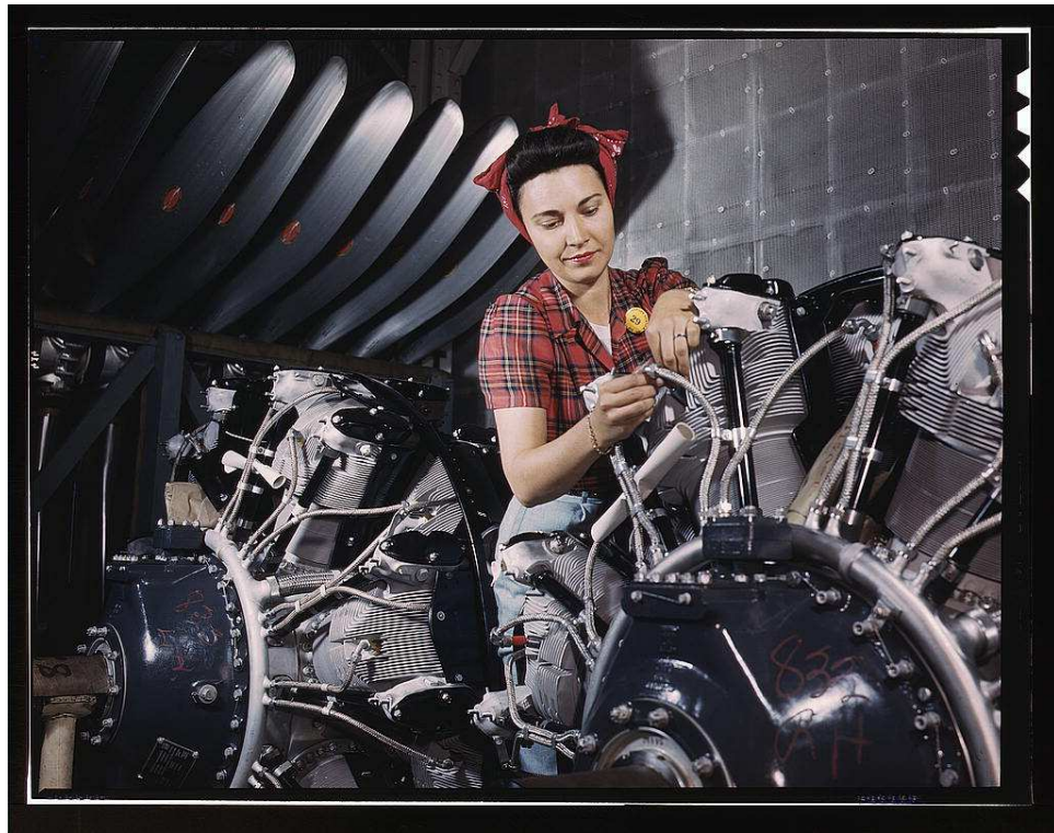
Figure A.4: “Woman working on an airplane motor at the North American Aviation Inc. plant in Calif.” (June 1942). Made for the Office of War Information.