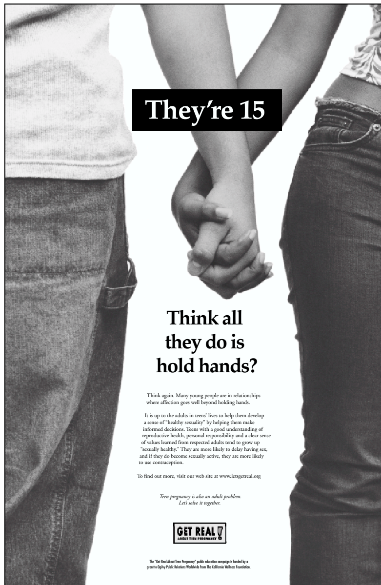
Figure A.6: Get Real About Teen Pregnancy public education campaign. Ad campaign for parents. (2002).