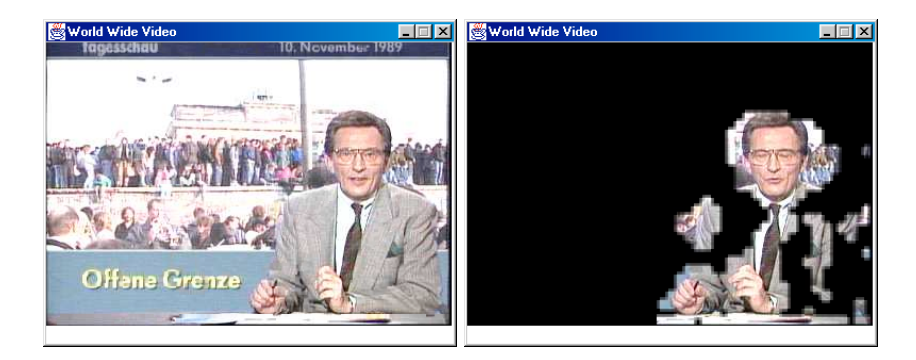
Figure 8.4: Visualization of the encoding of two consecutive frames from a TV broadcast (source: ARD, "Tagesschau", November 10th, 1989): Blocks that have not changed significantly from the left frame to the right frame are colored black.

quality of the video replay, for example at the beginning of a new scene, at the cost of bandwidth. The first frame recorded or sent when a client connects is an I-Frame.