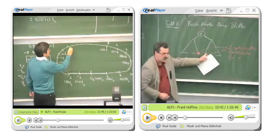
Figure 8.1: Two chalkboard lectures captured and played back with commercial Internet broadcasting systems. Due to lossy compression and low contrast, the chalkboard content is difficult to read. The lectures where given and recorded at Freie Universität Berlin.