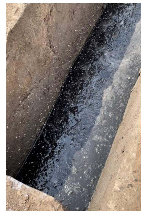
Figure 166: Drainage in the process of being down into the stream. Through the movement a

away of a given blood meal (also see Figure 16). This underlines how for my interlocutors mosquitoes and malaria are both omnipresent co-dwellers and signify a recurrent health problem. Even though rapid tests for malaria are easily available with relatively low costs, it leads for many to regular treatments without medical tests when experiencing a variety of symptoms – fevers, general weakness, chills, headaches, and other. For many, these symptoms or the malaria diagnosis are a constant by-product, produced by the fluid and multispecies conditions of the abattoir being a hotspot for this parasitic infection. 53 Following I.A.8: "in any contaminated place you find mosquitoes. You know if there is mosquito there is malaria. That is like that emptied. A cleaner is pushing the water to flow here." As part of that, labour and living conditions of cloud of insects is flying above the water.