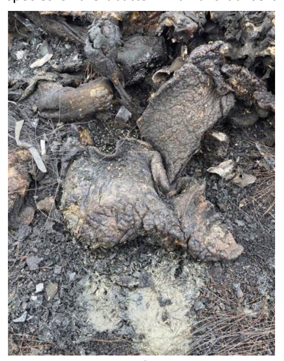
Figure 21: Decomposing fluids and materials with maggots crawling in them.

Organic waste as part of the streambed-abattoir meshwork, where many pathways knot together, illustrates complex but ongoing interdependence and enmeshment of co-dwelling species of the abattoir. Humans utilise the streambed terrain by disposing of their waste