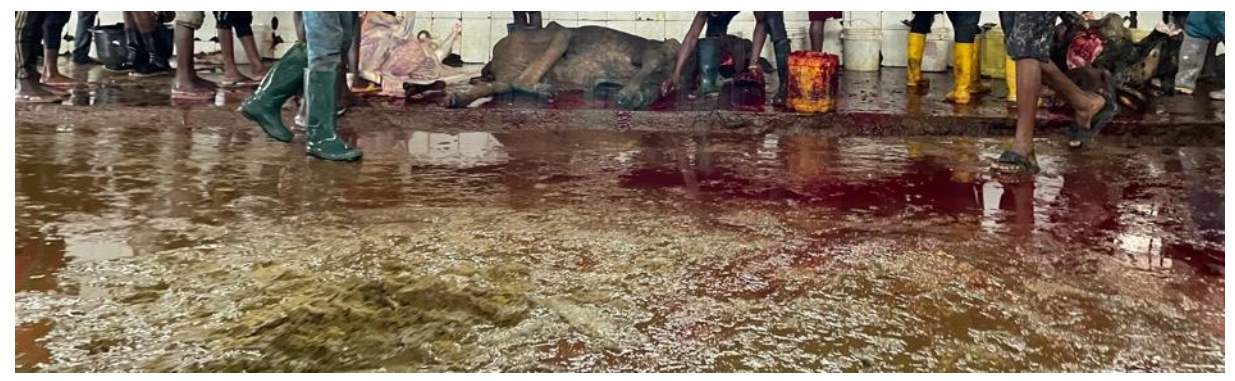
Figure 7: The kill floor of the slaughterhouse. Fluids and bodies entangling in activities.

other fluids and materials and leaving in new composition with meat products, bodies or down drainages to become part of a shaping texture of other pathways again. It is a basic force on, in, and through which many activities are entangled.