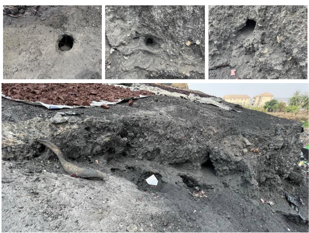
Figure 4: Rodent burrows at the blood boiling site towards the streambed. Blood chunks are drying on planes above the burrows and next to it are huts where workers of this site sleep or store work materials.

Humans utilise abattoir space for small huts to occasionally sleep in as part of spatial houseing. As Figure 4 shows in a collection of photos, right next to their material hut constructions are rat<sup>31</sup> burrows and potentially countless underground tunnel systems under the slaughter slap and de-furring hills and beyond (Sodikoff 2019: 103). Above ground, human activities of