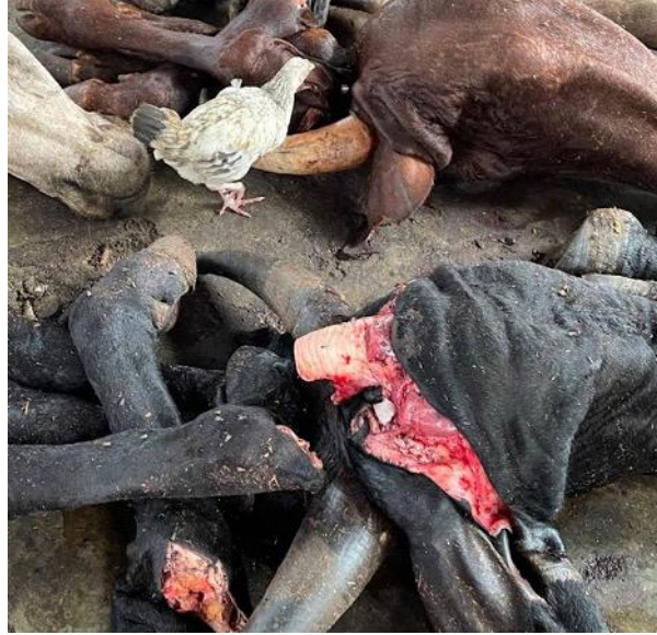
Figure 13: Semi-domestic chicken roaming in the market around feet or through cattle body parts on display on the market floor. These chickens are owned by people and at one point killed and consumed.

While accepting this co-habitation amongst many of the other species, they create more intimate ties to a cat, by feeding and occasionally petting it. The cat creates desired separation to rats by hunting them. Even though they do not stay at night when rodents emerge from their nests and engage in more intense sociality with their co-dwellers, they do not want them near their shop, perceiving them in similar narratives to what was discussed in the example of the dead rat and my veterinary colleagues.