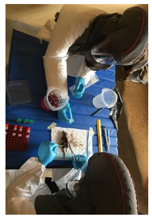
Figure 10: Process of dissecting a caught shrew in

Looking at Figure 10, the potential threat to human health expected to come from certain rodent species could not be more drastically exemplified by the full body personal protective equipment (PPE) of veterinarians in the process of dissecting a caught rodent from the abattoir. This is a harsh contrast to the close entangled co-habitation that many human dwellers have with these small mammals in their daily life. Thinking through meshwork threads here underlines complexity that can arise along a context of multispecies assemblages of not-distinct beings or entities, permeable and leaking, when they are operated under a zoonotic framework which expects potential of cross-species infection and circulation of full body PPE (photo by a colleague). infection through the presence of a certain species (Lynteris and Keck 2018: 23-24).