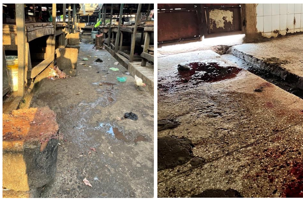
Figure 12: Left photo shows the empty market in the evening, after the workday is over. A chicken is roaming down the alley. Right photo shows the inside of the slaughterhouse with remnants of a late slaughter in the evening that will be cleaned the next morning.

This entanglement is also facilitated by a scarcity of water. While a borehole situated adjacent to the slaughterhouse is available to clean the slaughter room at end of workday through a connected tube, the remaining area has no to little access to tab or free water. This means that everyone has to buy water from suppliers which makes water a costly and limited resource. Hence, cleaning oneself, tables, dishes, animal-others, and utensils is done with as little water as possible, leaving out floors and other areas from extensive cleaning processes in the market, lairage, and other places. The rats are eating up the plenty abattoir leftovers and become part of these livelihoods and other multispecies activities, while their leaking bodies leave threads behind. Therefore, as Figure 12 underlines, their presence is deeply connected with ruminant slaughter, its products and domestic human activities of cooking and eating.