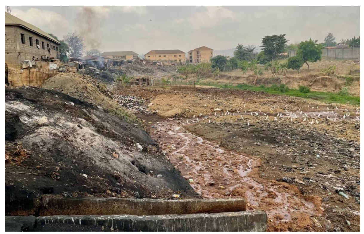
Figure 203: Main drainage spilling its contents into the streambed, digging a path into the ground until it reaches the stream.

Similar to what can be seen in Figure 23, many abattoirs in Nigeria are located near water bodies, which makes the enmeshment of this stream with this abattoir and the wider region one example among many other (Daramola and Olowoporoku 2017: 26). Further, as previously discussed, microbes travel not only with forces such as water but also with air flows, or with help of other species' bodies (Cañada 2021: 165). Possibilities for movement and new interactions are endless, and each one gives rise to unique specificity and proximity of entanglements that co-shape meshwork paths of the abattoir but also the wider area in complex ways.<sup>67</sup>