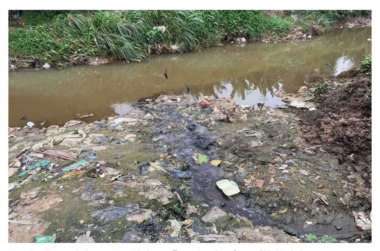
Figure 214: The streambed water mixing with abattoir effluents. Over the surface small black birds chase insects.

in which entities, both human and more-than-human, build collectives that coexist and interact with each other and (pathogenic) microorganisms in complex entangled ecologies that evolve to become together in emergent interaction with other determinants of multispecies health and illness.