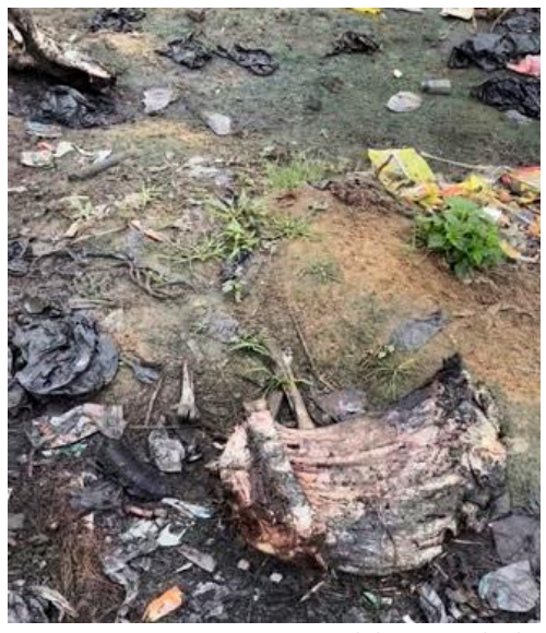
Figure 180: Carcass parts around the streambed.

I.A.15 tells me that abattoir activities arrange to the presence of dogs and as part of that try to incineration organic waste properly to disconnect dogs from hazardous abattoir waste. The accounts and experiences of the daily re-collection practices before incineration, also visible in Figure 20, underline day-to-day difficulties of this preventive method. As I.A.15 and others argue, there can be multiple health challenges connected to dog ecologies around abattoirs. Concerns about diseases transmittable between humans and dogs through