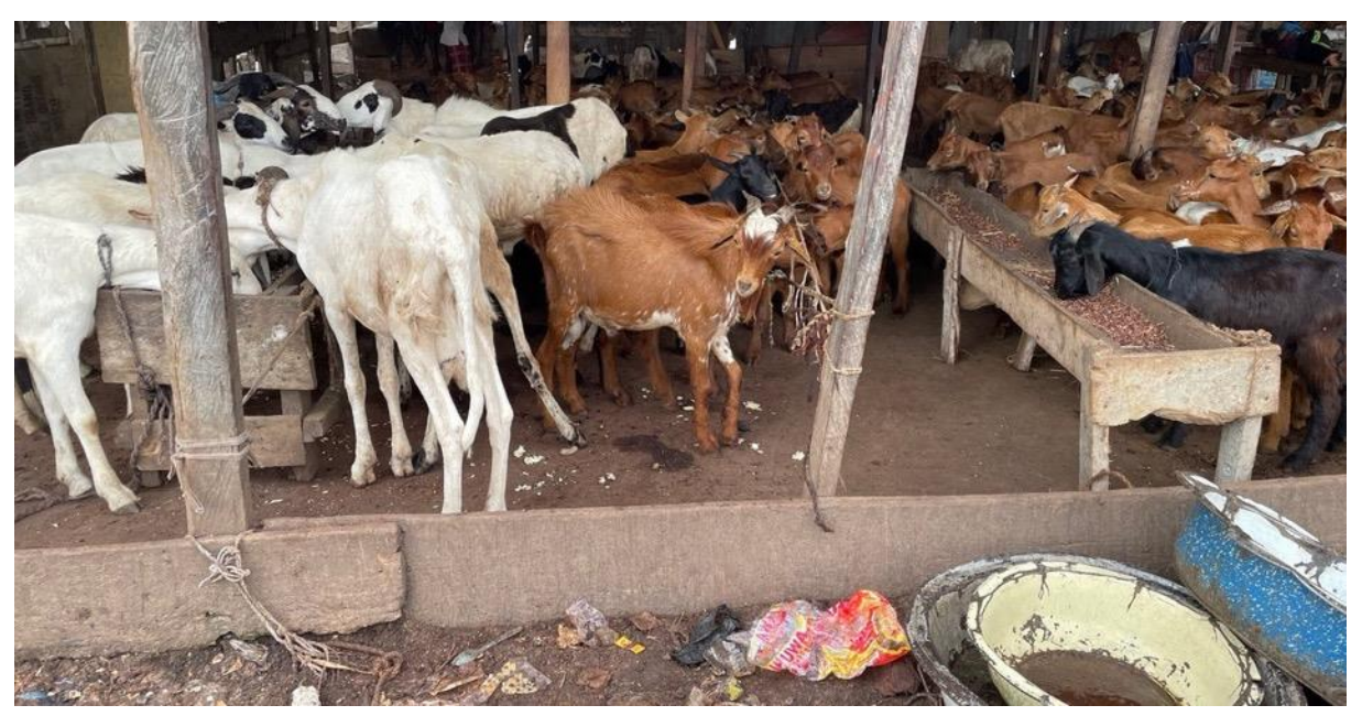
Figure 14: Small ruminant lairage during rains. The domestic animals are put under the cover of sheds where people also spend their time.

As I.A.7 explains and Figure 14 shows, during rains and rainy season people and animal-others share smaller spaces that remain dry. This is reducing separation and creates more intimacy among different species, desired or undesired. Thus, another shaping factor of paths in the abattoir meshwork is seasonality. In Ingold's (2000) understanding, material structures of sheds, benches and dry corners gather multispecies bodies in their need or desire to find shelter from heavy rains. This results in closer physical proximities. In regards to the previous chapter, this can influence intensity of entanglement along meshwork threads with potentiality of certain pathogen circulations. Not only is the shared space in the shadow of sheds smaller but research also shows that, e.g., viruses that circulate between rodent and human bodies survive longer in milder temperatures and humid conditions (Casanova et al. 2010: 2712). This means that the darkness of sheds and additionally also humid weather conditions prolong life spans of certain viruses that can affect multispecies bodies in these times. <sup>49</sup> Further, research shows that many zoonotic and vector borne diseases experience