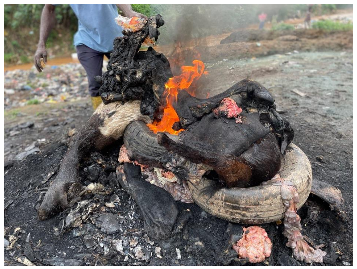
Figure 178: My interlocutor I.A.17 in the daily process of incinerating disposed bodies and body parts of abattoir activities.

To continue analysing specificities and proximities of interspecies thread-entanglement I draw on the involvement of my interlocutor I.A.17 with the streambed. I remember the worried comments of my veterinarian colleagues in the project after I tell them about the day and show them photos (see Figure 17 and 18). They want me to protect myself better to not get bovine tuberculosis (BTB) or something else from the pile. They add that I.A.17 most probably is infected with BTB or other pathogens due to his daily work. Further, the first time I inspect the pile of disposed organs of a slaughterhouse workday in conversation with I.A.6, an abattoir veterinarian, he anxiously raises his voice to stop me from leaning closer. Both, my colleagues and my interlocutor worry that I get infected through pathogenic traces in the air or by accidental physical contact. These moments accentuate how the entanglements with disposed organic materials and the streambed activities of I.A.17 are in their intensity potentially harmful for his health.