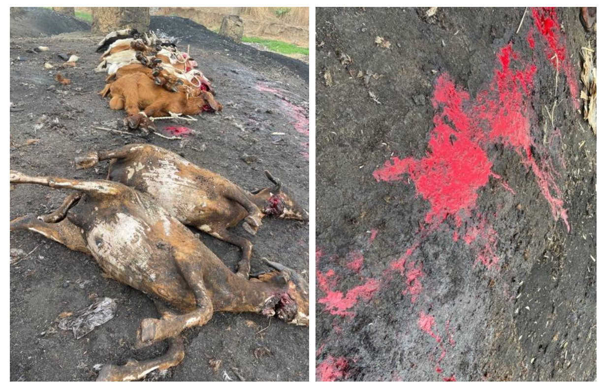
Figure 5: Slaughter slap and de-furring site behind the slaughterhouse. The small ruminants in the front are de-furred already, their fur burned off from the fires in the chimney. The others in the back wait for de-furring.

and how these are in this case intentionally carried along to entangle anew somewhere else with other meshwork threads.