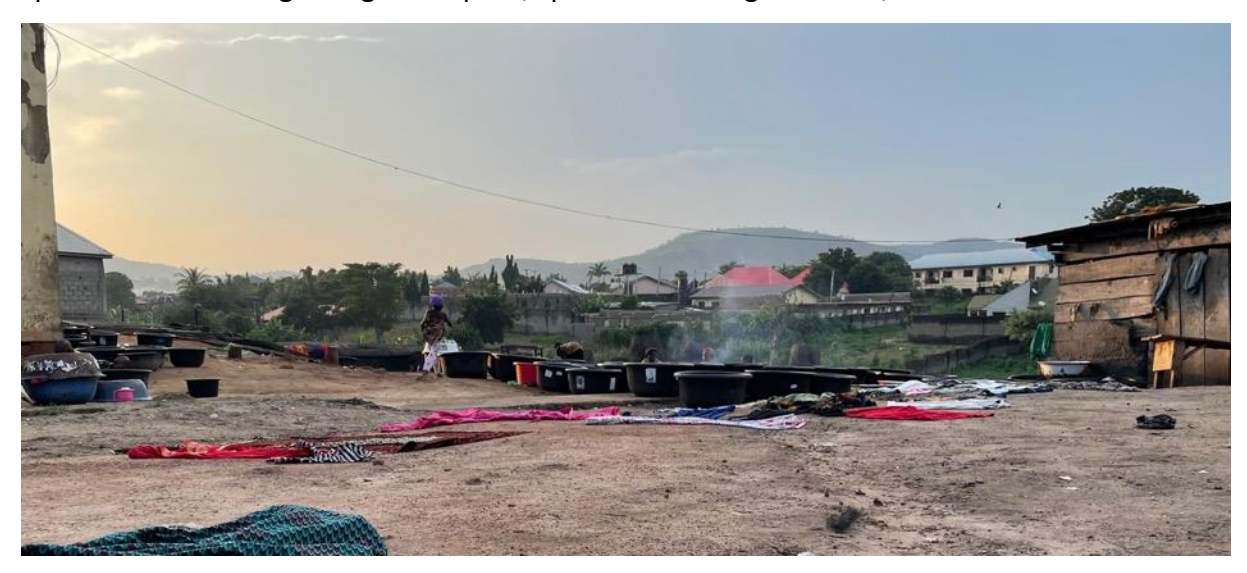
Figure 2: Evening in the abattoir. Fabrics lie on the floor next to the slaughterhouse, spread there by women to sit on. In the back, dinner is cooking on small improvised firepits in front of the slaughter slap, visible through faint rising smoke.

sites where individuals establish spatial house-ing and engage in various activities to sustain their daily lives.<sup>26</sup> Accordingly, for many of my interlocutors the abattoir occupies a central space in their life regarding time spent, spatial house-ing activities, and emotional ties.