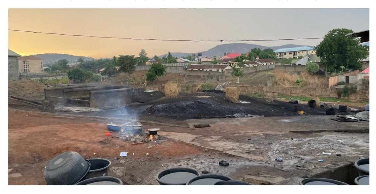
Figure 3: Dinner cooking in front of the de-furring, blood boiling and slaughter slap side.

Against this backdrop, I am drawing on Biehl and Neiburg (2021: 543) to challenge stagnant assumptions ingrained within anthropological discourse surrounding viable forms of dwelling, habitation and belonging. By reconceptualising the abattoir as a multispecies house, a space of spatial house-ing, a domestic to peri-domestic dwelling site, I broaden the notion of "houses"