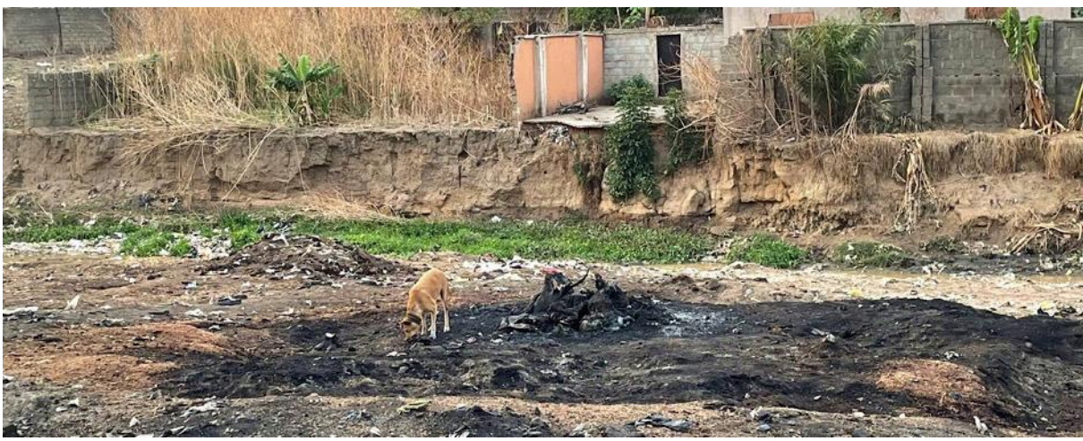
Figure 19: Photo above, roaming dogs licking up remnants from a late slaughter at the slaughter slap and de-furring site. Lower photo, dog gnawing on left-overs of the incineration site in the streambed.

An example of complexities surrounding potential pathogenic manifestations of multispecies entanglement in and with a peri-domestic space in public health concern can be found here. As I.A.17 tells me, the half-burned organic materials he has to collect every time to pile again for burning are dragged away and consumed by dogs. For many of my interlocutors, these dogs are an intrinsic part of the abattoir dwelt community, as elaborated in chapter 5.1. However, as I.A.15 tells me, there are also risks perceived in their presence.