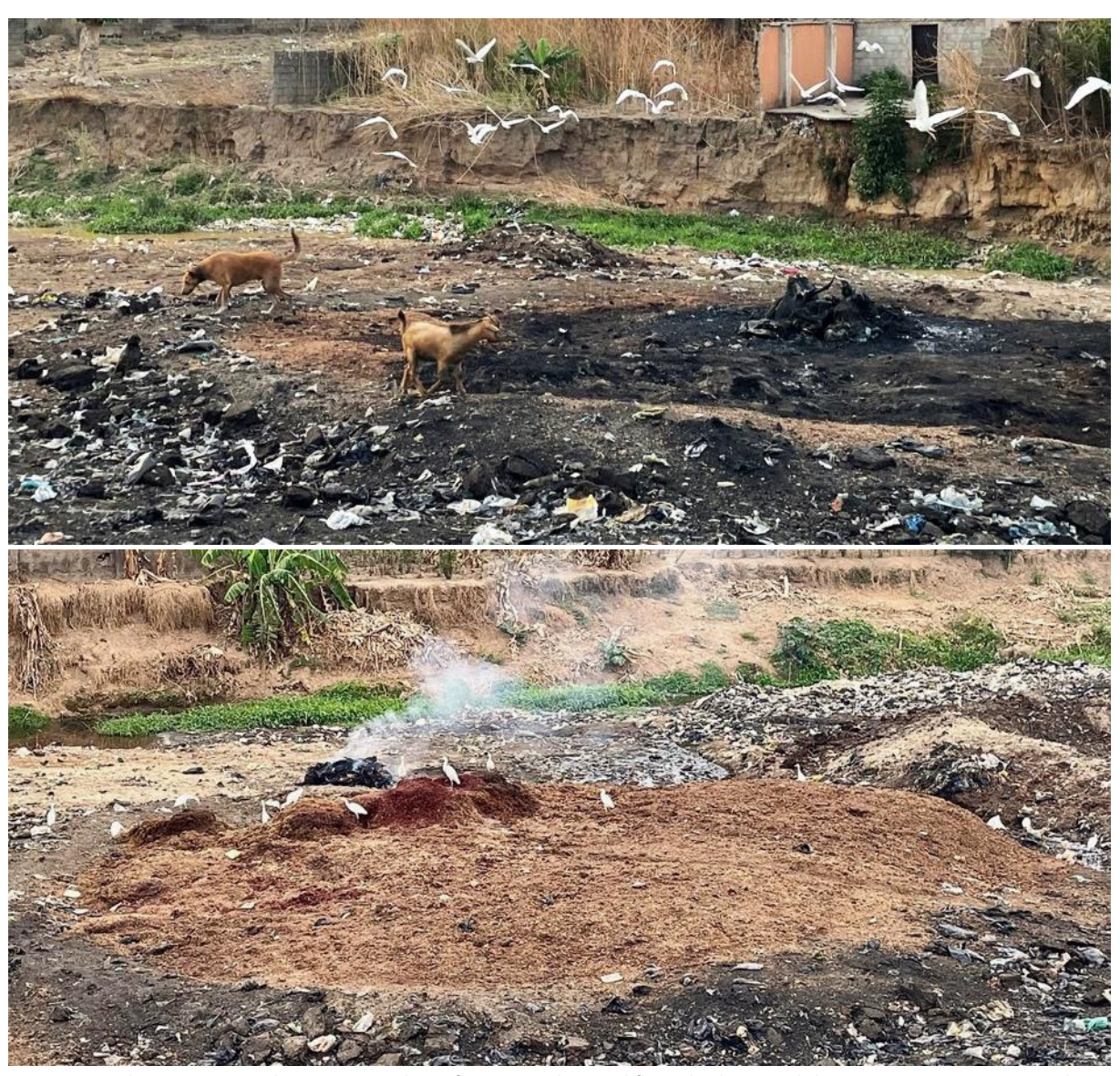
Figure 192: Photo on top: Multispecies mingling of a goat, a dog, and flying birds around the incineration site. Lower photo: The dung pit in the streambed with birds searching for food and rising smoke from the incineration site behind.

as "multispecies muddles". These muddles arise from decades of reciprocal adjustments and adaptations, enmeshment within a shared physical environment, as highlighted by Kelly and Lezaun (2017: 392). Such an understanding emphasises interconnectedness and interdependence of all actors in a given ecosystem and ways in which their interactions can give rise to emergent and unpredictable phenomena, from infectious (zoonotic) diseases to queries about immunity. The latter is important to include as well, as "immune systems exist almost ubiquitously across the living world [...] virtually all domains of biology and medicine are connected to immunology" (Pradeu 2019: 1).