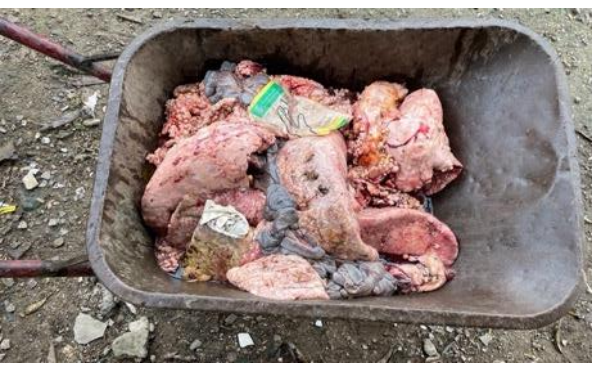
Figure 17: Condemned body parts from the slaughterhouse after a workday ready to be burned in the streambed.