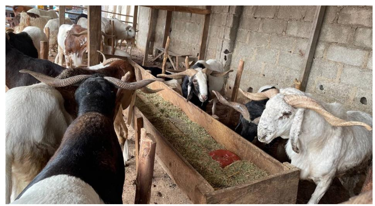
Figure 8: Ram shed with a bench in the back on which people eat, wait, rest or sleep.

What does it mean to have them as co-dwellers that entangle traces along paths in the abattoir?