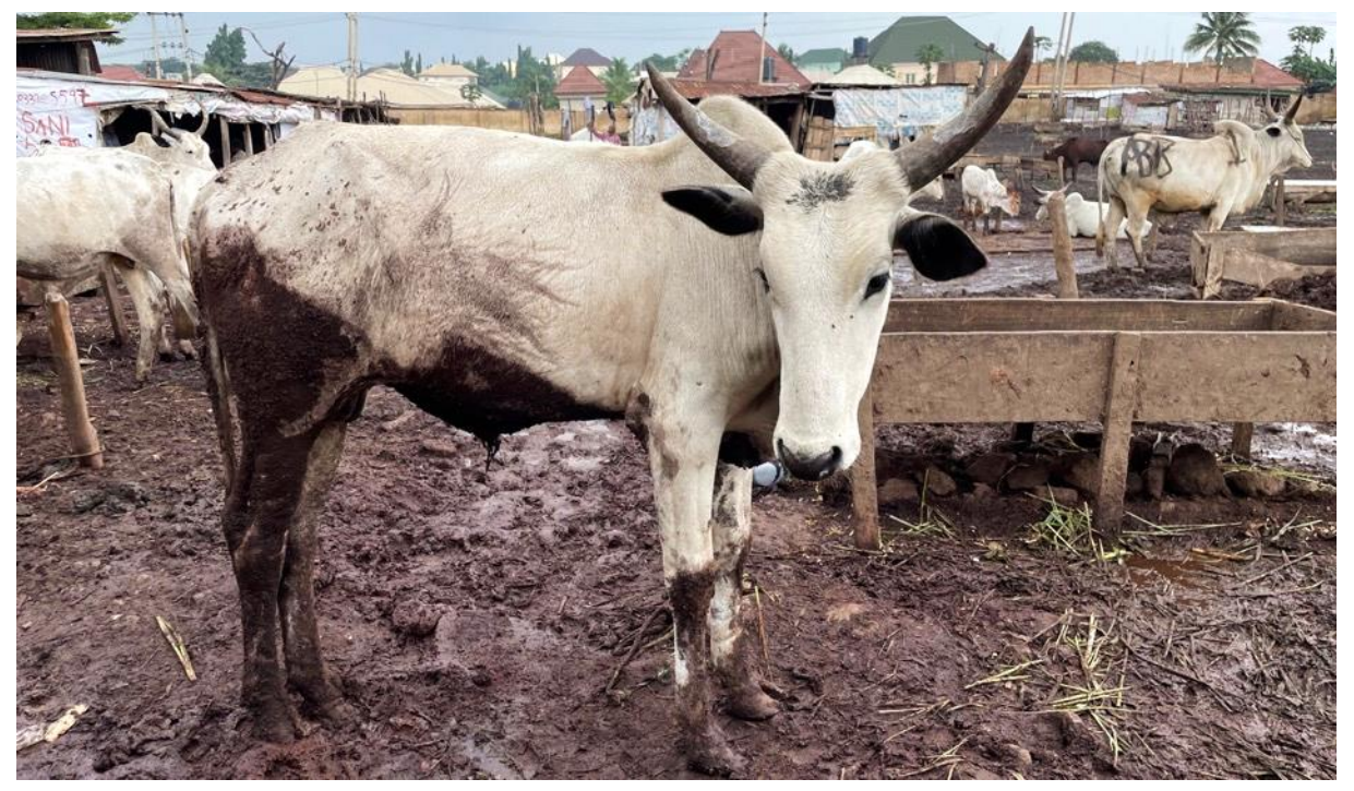
Figure 15: Photo above shows the flooded lairage. The second photo shows young cattle on a dryer patch. Its body market by the ground.