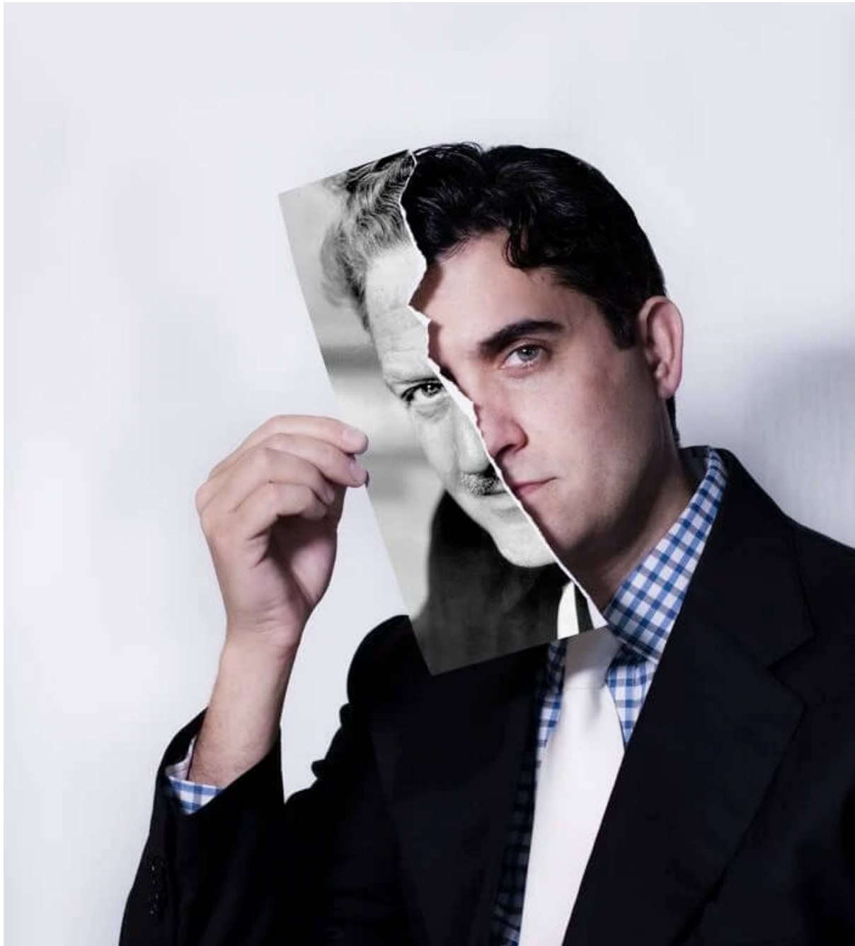
Memet Ali Alabora

process only quicker, and naturally, more traumatic. Wales was an accidental choice but it feels now like a second home to him.