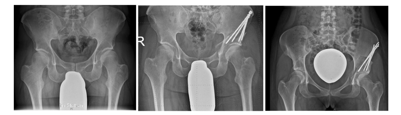
Fig.1 a Preoperative radiographic assessment for indication of PAO. b Correction and fixation with screws. c Correction and fixation with K-wires

bone grafts were induced into the supra- and retroacetabular gap previously created by iliac osteotomy as previously described [11]. The target of intraoperative reorientation was defined as normalization of LCE greater than 25^{\circ} , AI less than 10^{\circ} and FHEI between 10 and 26%.