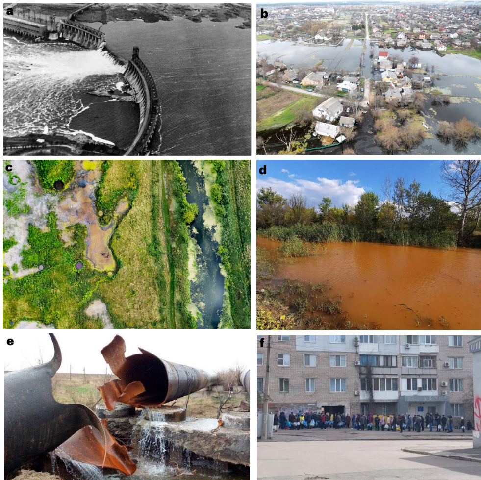
Fig. 3 | Examples of impacts on water resources and infrastructure in Ukraine during armed conflicts. a , The dam on the Dnieper River near the city of Zaporizhzhia after reportedly being blown up by Soviet special forces in 1941 in an attempt to delay the offence of German troops. b , Demolition of the dam on the Irpin River on 26 February 2022 caused flooding near the village of Demidov in the Vyshhorod district of Kyiv region. c , Craters formed by shells on the floodplain of the Irpin River. d , Water in the Kamyshevka River polluted by

mine waters (picture taken in 2021). e , Damaged pipe near Kiselevka village in the Kherson region (picture taken in April 2022). f , People in a line for drinking water in Mykolayiv (picture taken in April 2022).