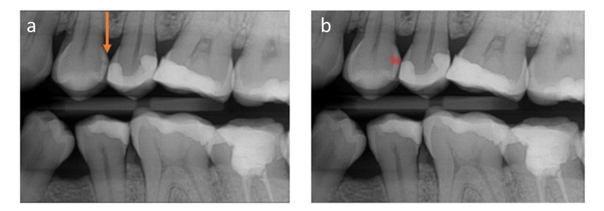
Figure 1. The radiographs shown in the vignette investigation. (a) Radiograph with a caries lesion; the orange arrow indicates the presence of the caries lesion (standard communication/control).(b) The same radiograph, with the caries lesion being indicated by an AI-generated pixel blob in red (AI-based communication).