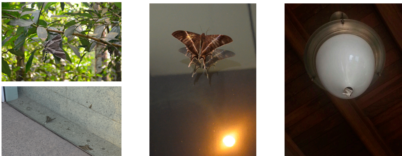
Figure 2. Lyssa zampa moths in forested and urban areas photographed during the mass emergence in 2014 across Singapore. Several individual moths were seen attracted to city lights and eventually trapped in glass panels or light bulbs.

Fifty-nine dead specimens and sixty-one live specimens of L. zampa were collected and measured from both urban and forested areas with the help of volunteers across Singapore between May 2014 and July 2014. A vernier calliper was used to measure body length, body width, and wing length of all specimens (Figure 2) using standard lepidopteran measurement protocols [6,23]. The specimens were divided into two batches depending on the month of data collection. Batch 1 spanned from 23 May to 9 June 2014, whereas Batch 2 spanned from 23 June to 31 July 2014.