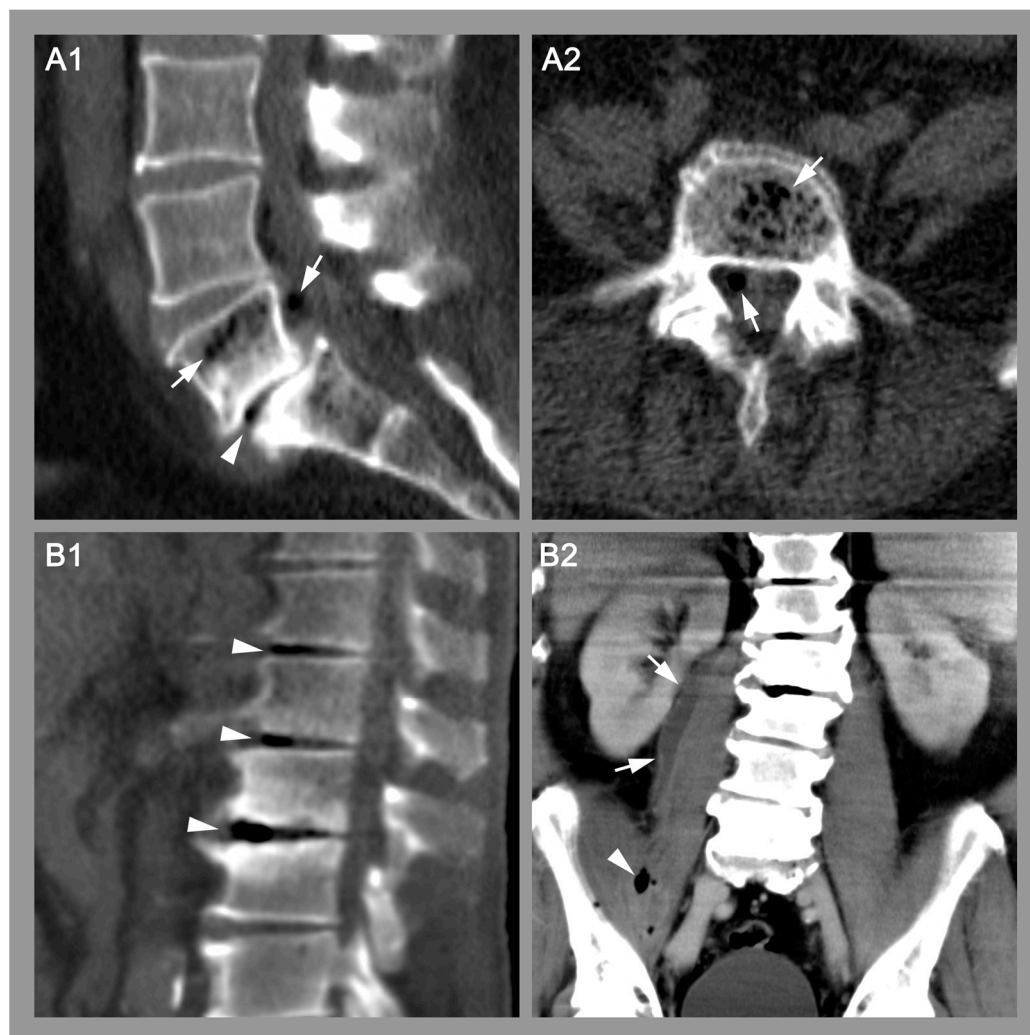
Figure 2. Imaging examples of two patients with confirmed spondylodiscitis. (A). Sagittal (A1) and transverse (A2) CT images showing gas within the disc (arrowhead), within the vertebra and within an epidural abscess (arrows) of a 50-year-old patient with urosepsis and spondylodiscitis L5/S1. Blood cultures and intraoperative tissue samples revealed Escherichia coli as the causative pathogen. (B). Sagittal (B1) and coronal (B2) CT images of intervertebral gas (B1, arrowheads) within three discs and gas (B2, arrowheads) within a psoas abscess (B2, arrows) of a 75-year-old patient with spondylodiscitis L1-3. Blood cultures and biopsy samples revealed Streptococcus pyogenes as the causative pathogen.

Gas was found in 31 patients (23.0%) in total and in 19 patients (20.4%) with positive microbiology. CT scans showing intervertebral gas in two patients with spontaneous spondylodiscitis are presented in Figure 2.