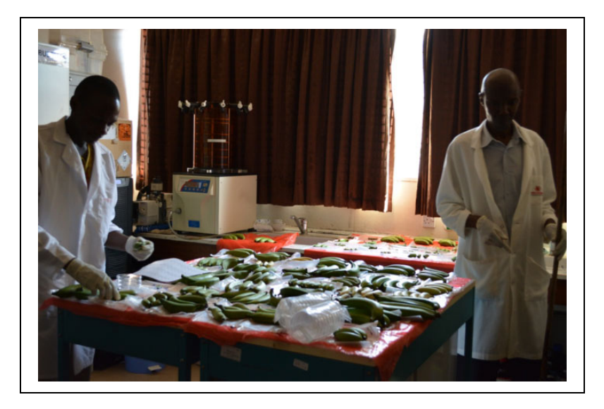
Figure 6. Preparing harvested bananas for lab analysis, September 2017.

everything about generating bananas embryos and plants from cells in the tissue culture lab since she started out nearly twenty years ago.<sup>11</sup> Due to her unique expertise, she had herself been to the Ugandan lab several times to help manage problems with their tissue culture procedures and noted that there was a high risk for contamination. However, Tracy added that sometimes one had the right precautions and procedures in place, but "sometimes banana cells just don't want to work. They just don't do the work you want them to do."