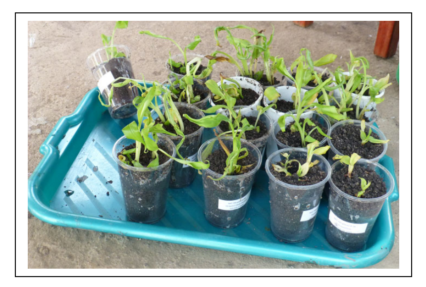
Figure 5. Freshly weaned banana plants, February 2016.

milk," and releasing them so they have to feed themselves. These small plants were then placed in the greenhouse to allow them to grow to about a meter of height before planting them in the field. It was not until these plants were planted in the field trial that their individual traits and characteristics could come to the fore in ways that were legible to Ugandan biologists.