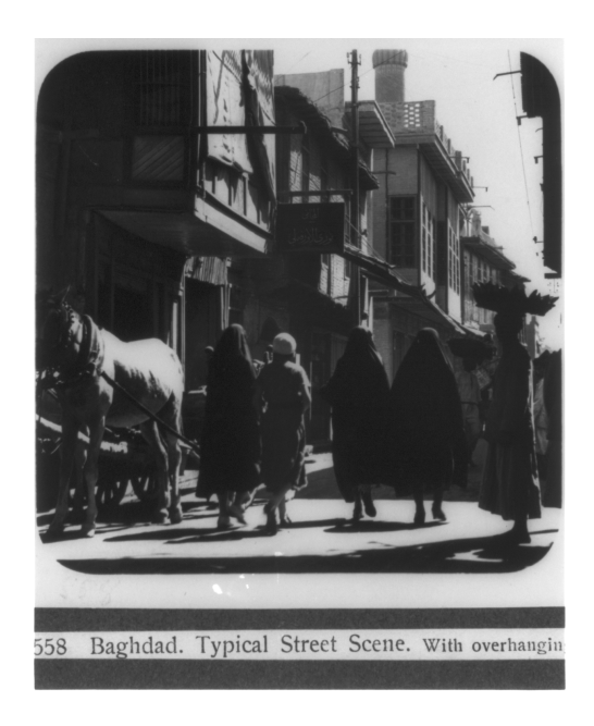
Fig. 1.10: Street Scene in Modern Baghdad (with Oriels)

The criteria just mentioned do not render Baghdād an Islamic city in the sense that Islam per se was the determining factor of Baghdād's architecture or city life. Even if we think of building heights or the position of windows in residential buildings that might have been influenced by social norms of visual privacy, there is no textual evidence for this assumption in the case of Baghdād. It is also not clear that wooden lattices in front of windows ( mashrabiyyas ) existed in Baghdād in the period under investigation here (for evidence of modern window building, see fig. 1.10).