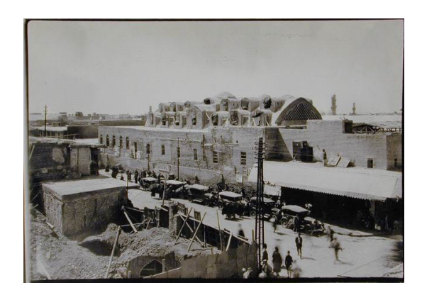
Fig. 1.7: Khan al-Mirjān in the 20<sup>th</sup> century (center)

market, where money changers and paper and book producers were also active. <sup>64</sup> In eastern Baghdād the Sūq al-Ṭīb comprised a flower market in the 9<sup>th</sup> century, which is not mentioned in previous or later times. From the 12^{th} - 13^{th} centuries onward urban "hotels with storagerooms" ( kh\bar{a}ns ) became part of Baghdād's cityscape, a very famous one being the Khan al-Mirjān erected in 1358 as source of income (waqf) for the madrasa of the same name (see fig. 1.7). <sup>65</sup>