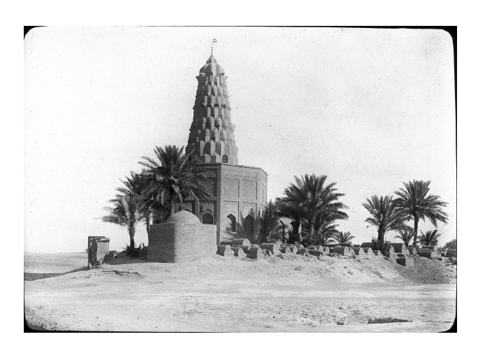
Fig. 1.8: Mausoleum of Zumurrud Khātūn with Palm Trees, 1924

cities of Baghdād. Others might have been plantations, orchards or kitchen gardens in which fruits and vegetables were cultivated for daily use.