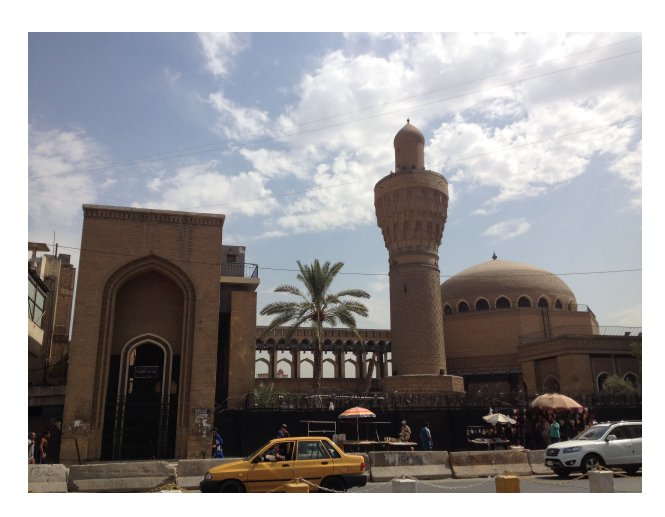
Fig. 1.4: Masjid al-Khulafā' (The Caliphs' Mosque) with the Ilkhanid Minaret, 2014

The Sultan's Friday Mosque in the Saljūq's palatial city was also extant and in use until the Mongol period, i.e. until the 14<sup>th</sup> century. Two further mosques, the Umm Jaʿfar and the Ḥarbiyya Mosques, which had previously served as local places of prayer, were raised to Friday mosques at the end of the 10<sup>th</sup> century by Caliph al-Qādir (r. 991-1031).<sup>58</sup>