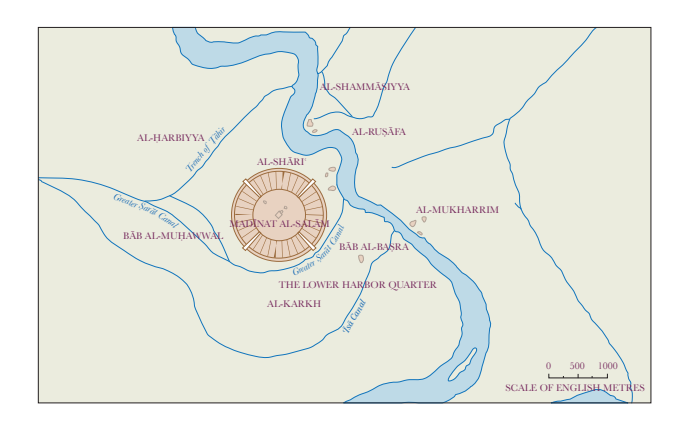
Fig. 1.1: The Neighborhoods of Baghdad (8<sup>th</sup>-9<sup>th</sup> Cent.)

On the western side there was al-Manṣūr's palatial city Madīnat al-Salām, mentioned above, and the Shāri' neighborhood to its north and northeast. This neighborhood was dominated by the Trench of Ṭāhir, which according to one Arabic source was a wide canal supplied by the Tigris.<sup>35</sup> Northwest of Madīnat al-Salām was the Ḥarbiyya neighborhood, in which al-Manṣūr had settled his troops and had established, among other buildings, the Quraysh Cemetery. In this cemetery the Shī'ī Imāms Mūsā l-Kāẓim (d. 799) and his grandson Muḥammad al-Taqī (d. 835) were buried, and at some point the Kāẓimayn Shrines, still extant today, were erected over their tombs. In addition, the tomb of the traditionist Aḥmad b. Ḥanbal (d. 855), which existed (at least) until the 1300s, stood there as well.