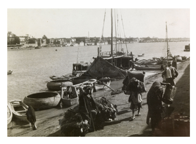
Fig. 1.2: Some Porters in Front of Sailing Boats, Rowing Boats and Motorboats on the Tigris, 1925

Moreover, it was a neighborhood that was mostly inhabited by Shīʿīs throughout the centuries under discussion here. The Baṣra Gate (Bāb al-Baṣra) neighborhood, to the southeast and east of the City of Peace, was well-known for the mausoleum of the ascetic Maʿrūf al-Karkhī (d. 816) that stood (at least) until the early 20<sup>th</sup> century.