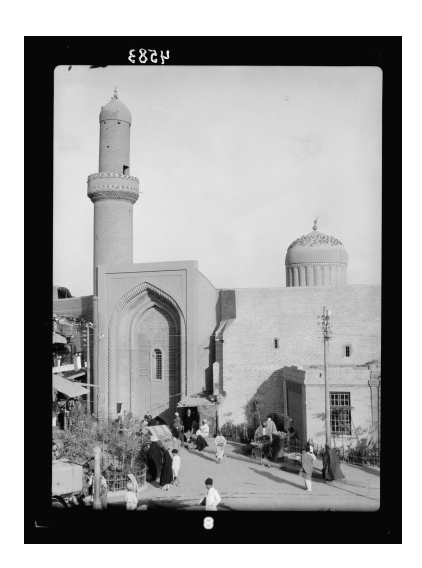
Fig. 1.9: Mirjāniyya Madrasa and Mosque

Baghdād's thriving success and architectural developments, however, owed much to the continuous supply of rents and tax-surplus coming mostly from the city's hinterland and the provinces, and thus to its position as an imperial center. When this flow decreased or started to dry up due to governmental crises, administrative failures and the gradual emancipation of the provinces (i.e. from the early 10<sup>th</sup> century onwards), building projects were reduced and scaled down, and the population and labor force of Baghdad began to shrink, gradually diminishing the demographic density. These processes resulted in a dramatic change in urban topography, which was alluded to above in connection with the city walls. Previously connected neighborhoods devolved into local clusters of settlements attached to markets and a central mosque, separated from each other by large empty, ruined spaces that were sometimes repurposed as fields or gardens. Such was the topographical situation of Baghdād from the Late 'Abbāsid and Ilkhanid periods well into the Ottoman period. The memory of Baghdād as a booming and splendorous metropolis, comparable only to Constantinople,<sup>74</sup> frequently led visitors of these periods to disappointment and evoked a feeling of nostalgia when they found that the idealized image preserved in Arabic literature contrasted starkly with the reality.<sup>75</sup>