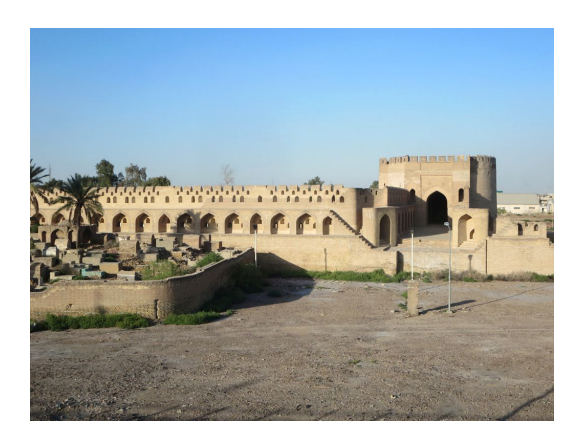
Fig. 1.6: The Wasṭānī Gate (Viewed from Outside), 2016

The Wasṭānī (or Dhaʿfariyya) Gate, also facing east and located north of the Talismān Gate, is still extant today, including a partially visible inscription from 1221.<sup>63</sup> The remaining two gates are the Muʿazẓam Gate (facing north) and the Baṣaliyya Gate (facing south).