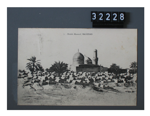
Fig. 1.3: Mausoleum of Ma'rūf al-Karkhī, 1924

Moreover, it was a neighborhood that was mostly inhabited by Shīʿīs throughout the centuries under discussion here. The Baṣra Gate (Bāb al-Baṣra) neighborhood, to the southeast and east of the City of Peace, was well-known for the mausoleum of the ascetic Maʿrūf al-Karkhī (d. 816) that stood (at least) until the early 20<sup>th</sup> century.