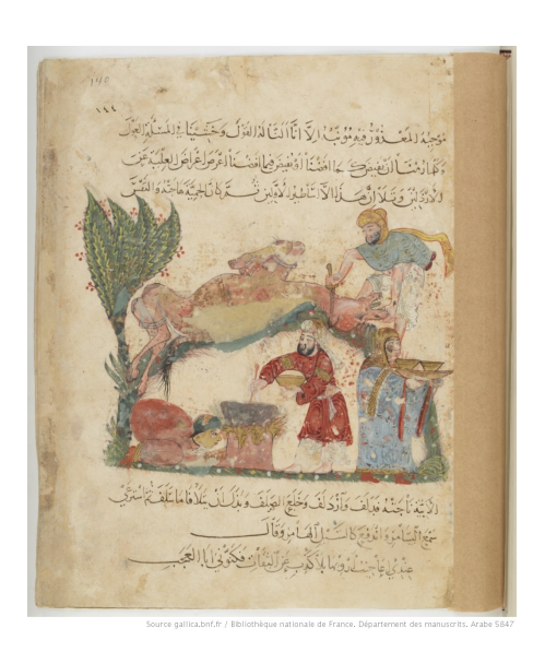
Fig. 1.11: Cooking Scene with a Butcher, Two Cooks and a Female Servant, Maqāma 44, Maqāmāt of al-Ḥarīrī, painted by Yaḥyā l-Wāsiṭī in 1237

kinds moved to Baghdād, attracted by the many possibilities for work and good salaries. Some of them were systematically recruited by al-Manṣūr, such as the engineer and legal expert Abū Ḥanīfa (d. 767). The historian al-Yaʻqūbī (d. after 908) mentions 100,000 craftsmen, engineers and architects, whom al-Manṣūr gathered to build his palatial city, as well as a huge security force to control them. Most of these people settled permanently in Baghdād after the completion of al-Manṣūr's building projects, in particular because the building activities during the next decades did not cease, but even gained momentum and continued to offer good sources of income. Starting with al-Mahdī, subsequent caliphs commissioned further construction projects for themselves and for their offspring, as did local dignitaries. The massive immigration of workers (and their families) caused new markets (and neighborhoods) to mushroom in order to fulfill the increased demand for various consumer goods and building materials. Boys selling water, cooks, bakers, barbers, grocers, butchers, tailors, shoemakers, tanners, load carriers, harbor workers and members of many more professions thus settled in Baghdād and made up a great portion of the non-elite segment of its society.