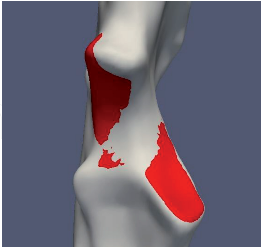
Figure 2. Colored animation of the in vivo humero-ulnar joint contact pattern at the ulnar joint surface at the beginning of weight bearing in a healthy canine elbow joint (red: Humero-ulnar contact). Joint contact is present along the medial coronoid process and the lateral and proximal aspect of the trochlear notch. The radius is not shown in this animation.

are present at the disto-medial and cranial aspect of the humeral trochlea and in the olecranon fossa, the anconeal and medial coronoid processes of the ulna and the cranio-medial region of the joint surface of the radius [95]. The same study showed a significant age-dependent increase in the subchondral bone density of the joint surfaces of all three bones, representing continuous adaptation of the bone to mechanical stress with increasing age [95].