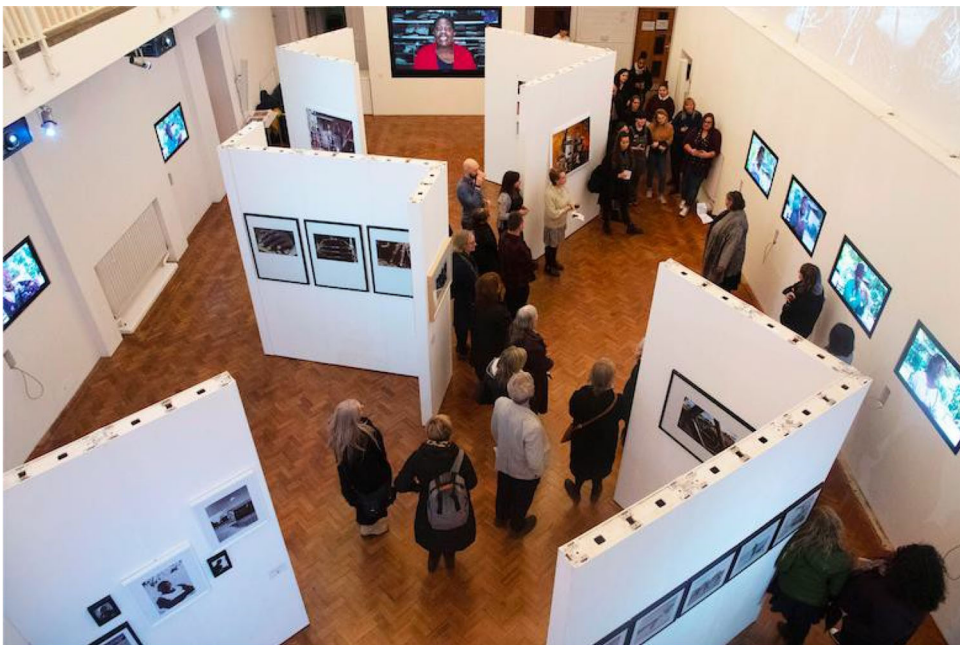
Exhibition opening at the Ruskin Gallery 16/01/2020