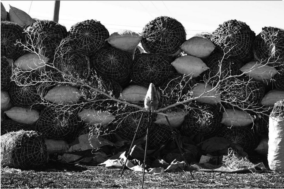
Angel of the Morning. (Image by David Daut Makala)

every point within the gallery, as to make the photographers omni-present in the space. The exhibition's layout was planned to emulate the labyrinthine architecture of the Kalingalinga neighbourhood through angled walls, none of them parallel and all different shapes and sizes to fit the varied work of the individual artists.