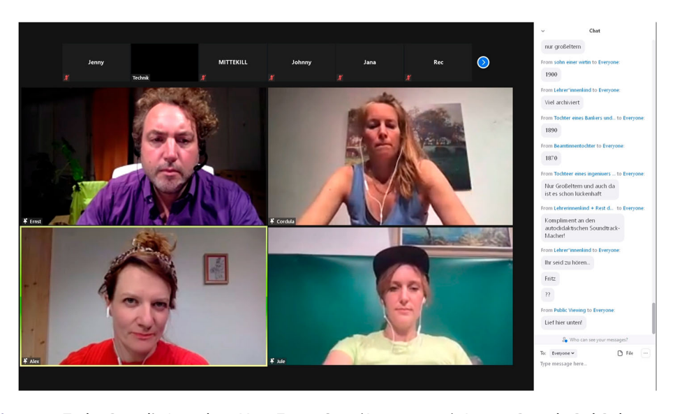
Figure 4. Turbo Pascal's Irgendwie Mitte Zoom-Com (August 2021).

In its exploration of social and economic class, the performance Irgendwie Mitte is a continuation of themes raised in our previous production 'Unterscheidet Euch!' (Distinguish Yourselves) that Turbo Pascal performed in an original analog version in 2019 at the children's and youth theatre Theater an der Parkaue, Berlin. For various festival invitations in 2021, Unterscheidet Euch had to be reconceived in a digital format. The crucial and important challenge for our collective lay in translating the participatory nature of the performance onto a digital platform. In practice, this meant transforming the active mingling of the audience in the theatre space into a lively and active digital exchange. With the constraints of the pandemic, Turbo Pascal had to choose between digital platforms in order to adapt their interactive processes and ways of communicating with the audience effectively. Ultimately, the team opted for a performance on Zoom, since it offers the widest range of accessibility and interaction for many users based on our research.