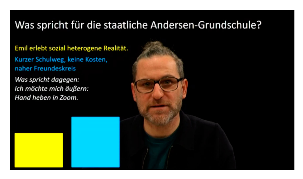
Figure 6. Interrobang: Familiodrome. Image shows how decision-making processes were integrated into the performance: while the actor narrates the fictive life story of Emil, various questions/decisions pop up for the virtual parent collective. The overlaid polling options and a diagram of polling results show how the audience of virtual parents divides in their decision-making processes. Translation from screen: Question: What speaks for choosing the state school for Emil? Option 1: Emil experiences a socially heterogeneous reality. Option 2: Short way to school, no costs, friends close-by. Option 3: What speaks against this choice: I want to intervene by raising my hand in Zoom.

the (still fictitious) claim that Familiodrome serves as a series of test runs for the development of future Al-controlled education (Figures 6 and 7).