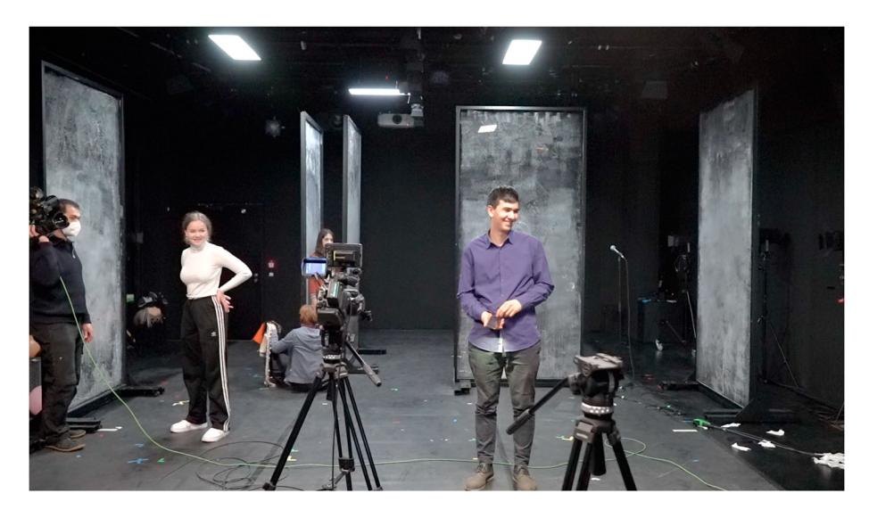
Figure 2. The playing space with cameras and glass panes at the DT Box.

these spaces. Instead they seemed to layer on top of each other much like an internal stream of memories would, picking up on the theme of Selbstvergessen. In addition, the production used a highly versatile set of six large movable smudged glass panes, able to create ever different spaces for the young players to set themselves up in, while also doubling as projection devices for showing personal photographs of the grandparents, for example (Figure 2).