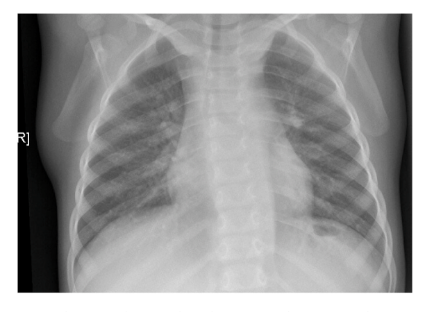
Fig. 1. CXR shows an chimney-shaped opacity in the upper mediastinum, the hilus region is rounded. The trachea is shifted to the left side and impressed. The lung parenchyma shows no pathologies. There are no calcifications or apical infiltrates.