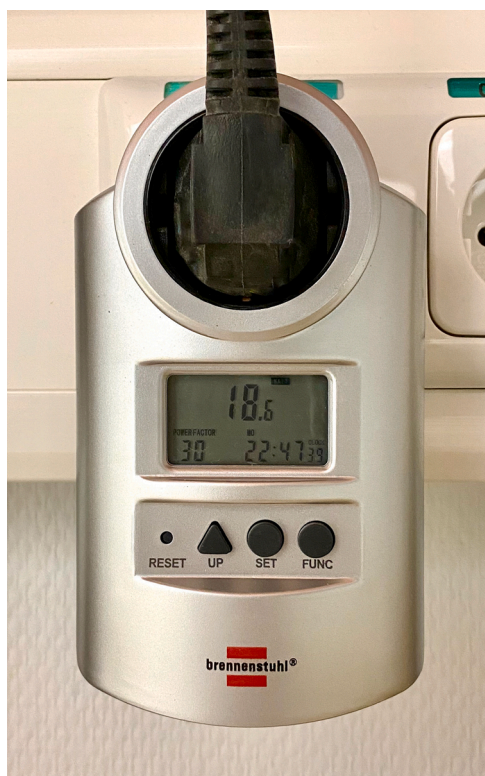
Fig. 2. Photography of an ammeter that was used for the measurements.

Statistics 24 for Windows 10 (IBM Corp., Armonk, NY; USA).