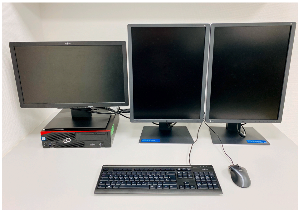
Fig. 1. Photography of a representative workstation consisting of a desktop computer, two medical-grade diagnostic monitors and a third monitor for the radiology information system (RIS).

A descriptive statistical evaluation was performed with IBM SPSS