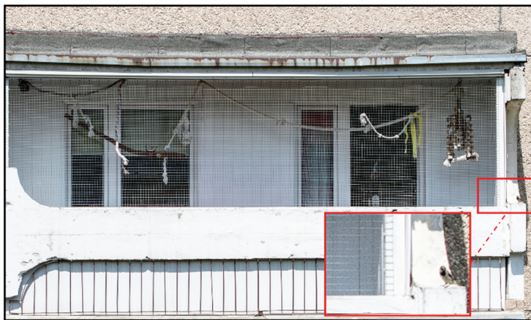
Figure 1. Home balcony keeping ornamental birds in Wałbrzych, Poland [author: Emil Paluch] (as the example of potential Salmonella spp. transmission from wild, free-living birds (zoom on the lower, right arrow) to ornamental birds outdoor).

Diet of cats and dogs is as varied as any omnivores; however, animal feed predominates, including raw meat [56]. Newborn cats and dogs consume their mother's milk; however, dogs may also consume placenta and colostrum, which is beneficial for the formation of a healthy microbiota. Owners of older animals often introduce a diet of raw meat, including poultry [57]. According to a large, structured, 2016 survey in the US, 3% of dog and 4% of cat owners feed their pets in raw products, and raw or cooked human food was purchased for pets by 17% of dog owners [3]. Such a diet, despite its many benefits, carries a high risk of Salmonella spp. infection. For instance, Finley et al. [58] observed that when dogs are fed with Salmonella -contaminated food, they can become infected and consequently shed the bacteria in their faeces to contaminate the environment, other domestic animals, and even pet owners [58]. Experimental addition to dog's diet probiotics