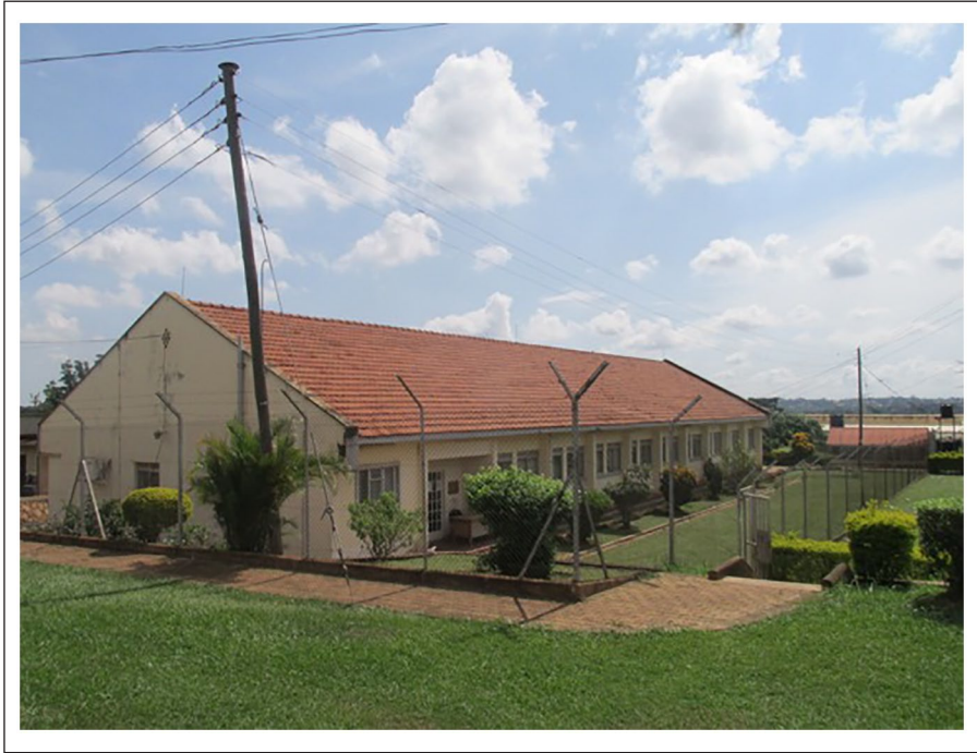
Figure 1. The biotechnology lab at Kawanda (the old colonial coffee lab), July 27, 2016 (S Calkins).

itself on being the first molecular biology laboratory in Sub-Saharan Africa that has managed to transform a living organism – the banana – in its own laboratories.