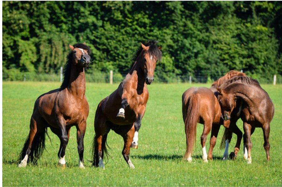
Figure 1. A group of stallions enjoying social contact on pasture (Agroscope, Schweizer Nationalgestüt, Switzerland).

This was preceded by a 2 week acclimation period in neighboring stalls, where they were able to make contact with each other for the first time (Figure 2a,b) before being transferred to the pasture with sufficient escape routes, a sufficiently high number of feeding places, and no mare contact.