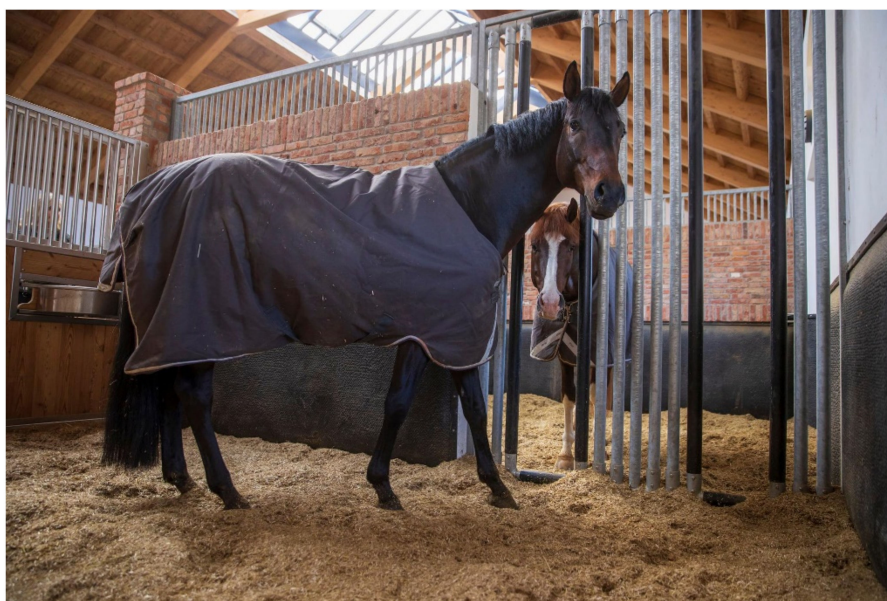
Figure 3. Socialbox. Gut Schönweide, Germany (Breeding Stallions Follow Him's Schönweide und Sky).

Because a gelding is usually unproblematic for the stallion, an alternative would be to keep the stallion alone in the box overnight and with a conspecific in a shared run during the day [16]. In this way, the stallion is not kept alone in the box all the time but is allowed to run out in the pasture for several hours every day with a conspecific, thus becoming a species-appropriate alternative for the stallion. It is very rare that this is not possible and that the stallion is better off left alone [16]. However, if this is the case, at least visual, auditory, and olfactory contact between the stallions should be possible [10]. Boxes with the possibility of physical contact and withdrawal, in which the stallions stand next to each other, would be suitable for this purpose (Figure 3) [17].