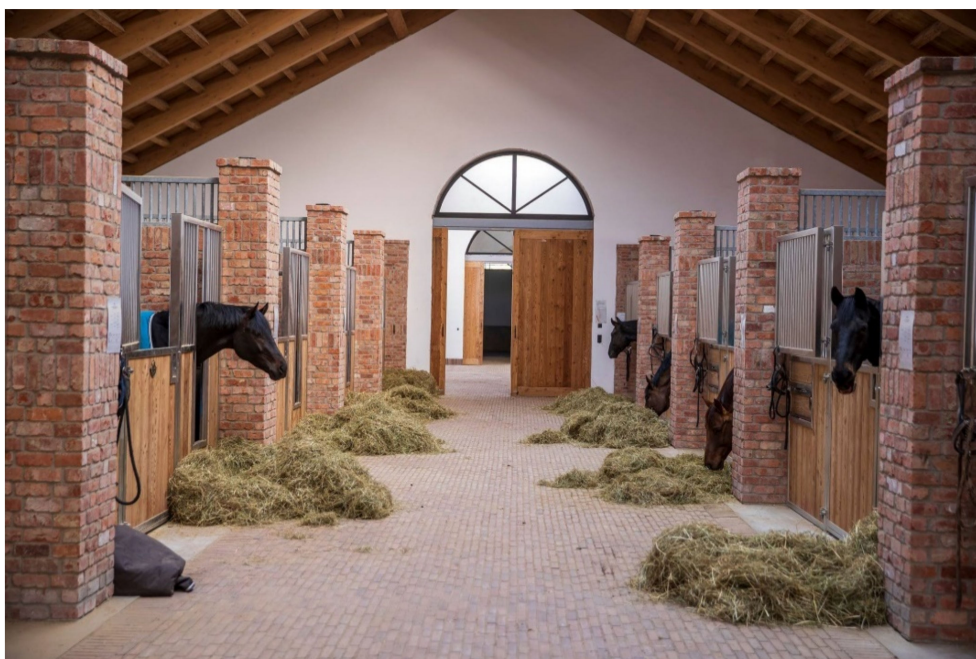
Figure 4. Social stall. Gut Schönweide, Germany.

There are individual stalls with special stall partitions that facilitate this ('social stalls'). It was found that typical stallion behavior, such as displaying, was increased only in the first 2 hours after stabling in the social stalls. In addition, the opportunity for extended visual contact (Figure 4), for example, when feeding together, and for physical contact was taken advantage of (Figure 3) [18].