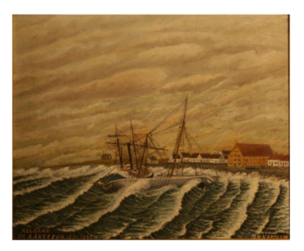
Figure 4. Oil painting of the ship Albano being wrecked in Simrishamn, painted by H. Kappelin.

There has been little documentation about the effects of the 1872 storm in Sweden until the recent publications by Feldmann Eellend [59] and Fredriksson et al. [12]. The 1872 storm mainly impacted the southern and eastern coast of the county Skåne, where at least 23 people lost their lives and more than 100 houses were destroyed [12]. Among the deceased, five people were pulled out from land by large waves in Simrishamn on the east coast, whereas the others were lost at sea. Figure 4 shows a painting of a shipwreck in Simrishamn, where high water levels coincided with large waves.