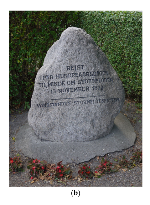
Figure 3. (a) Flood marks from 1694, 1836, and 1872 on a building in Schleswig, Germany. (b) Flood mark at Gedesby church (Gedser, Denmark) to memorize the 100th anniversary of the 1872 storm surge.