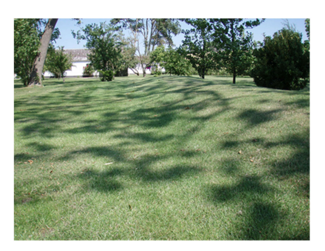
Figure 5. Remnants of a dike on the Danish island of Omø constructed after the 1872 storm, but later partly removed.

Along the Danish coast, other minor dikes were built to protect against a similar storm. However, as time passed without any storm surges reaching close to the 1872 storm surge level, flood risk awareness diminished. For example, the dike on the island of Omø that was constructed after the 1872 storm surge was later partly removed (Figure 5).