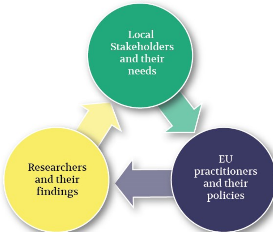
Figure 3: Forming communities of practice

The goal of the planned study trips had been to compare the knowledge of the international relations researchers and foreign policy analysts and the FPAs on building societal resilience in ALS and CO with that of the local stakeholders in the eastern and southern neighbourhoods, whose situation the EU policies are intended to address. For this purpose, we prepared extensive study trips with the researchers and policymakers from six European foreign policy administrations (the EEAS and the foreign ministries of France, Italy, Germany, Spain, and Poland) to Tunisia and Ukraine to meet local policy-makers, civil society representatives, experts and academics, journalists to discuss issues related to the conceptual framework. The study trips were designed to facilitate a dialogue between the three knowledge communities, thereby forming communities of practice (Figure 3). There had been