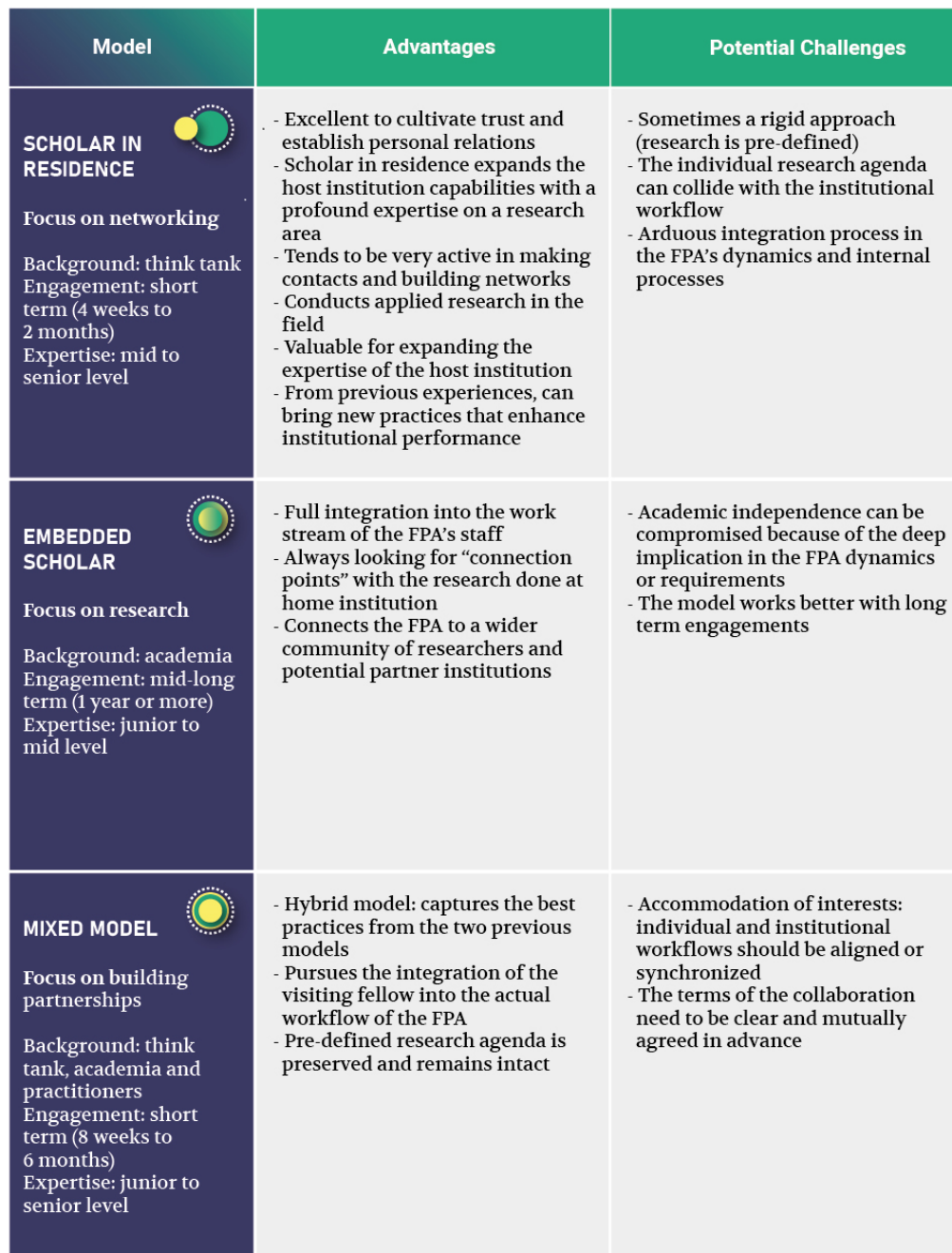
Figure 1: Models of scholars in residence

right people at an appropriate time and in a viable format. This model works best if the embedding is long-term, i.e., at least one year. Then, the advantage of building deep trust relationships can fully come into play. For this model to work best, measures must also be taken (and be agreed upon with the FPA) to ensure the continued academic independence of the embedded scholar, ideally by an ensured academic feedback circle.