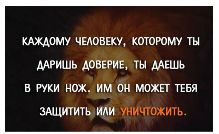
Figure 4. (Colour online) A WhatsApp and Odnoklassniki meme posted by my interlocutors.