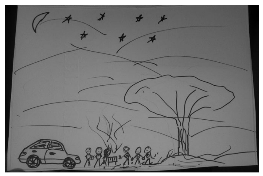
Figure 3. A 'mental map' of a shashlyk gathering by Bek, one of my interlocutors.

Significantly, shashlyk have a nocturnal dimension at their core which is well reflected in the 'mental map' drawn by one of my interlocutors. It depicts a company of tiny, smiling, stick-figures gathered around a steaming grill in what looks like an isolated natural location marked by a gigantic baobab-like tree and a vast starry moonlit sky (see Figure 3).