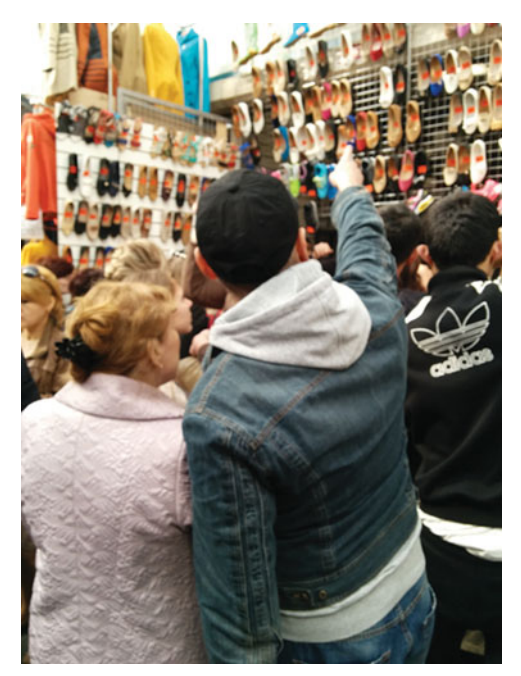
Figure 2. (Colour online) A seller shows shoes to a potential customer.

The space of the market allows for migrant subjects to be loud and noisy as opposed to quiet and invisible. Silence and invisibility seem to have become the customary behaviour adopted by external migrant workers in public spaces, and especially at home. This is largely due to the risk of being reported to the police by neighbours who might suspect that a flat is accommodating large numbers of workers who lack relevant registration documents. This might lead to police raids, detention, and pricey extortion. In contrast to the space of home, therefore, the marginal hub of the market allows for the sonorous becomings of migrant subjects and for multiple rhythmicities. The cacophony of different languages and the clang and continuous chatter have been cited by some of my interlocutors as particularly enjoyable aspects of their day. The humorous calls of male hawkers and the repetitive entreaties of female hawkers urging customers to enter a shop blend with multilingual chatter, slick advertisements broadcast from the market's central speakers, and criminally or romantically