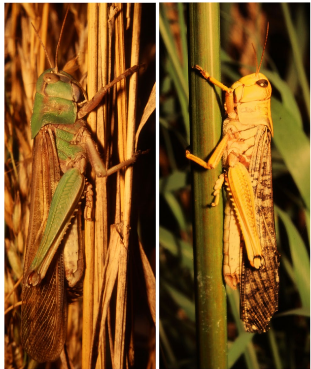
Fig. 2 Two males of Locusta migratoria from a breeding experiment in the lab of Peter Bräunig. The one on the left is in the solitary, the one on the right in the gregarious phase. Please note differences in colour, shape of pronotum, and length of hind leg femur.

preferences of breeding places. However, male genitalia, a morphological feature employed for exact species determination in insects, were of very similar shape, and artificial breeding experiments yielded nymphs with features of L. danica that had hatched from L. migratoria egg pods (Uvarov 1921). Nowadays it is clear that approx. 20 species of grasshoppers world-wide, taxonomically not closely related in most cases, may have the potency to form swarms and exhibit different phases (a phenomenon now called polyphenism, meaning the same genotype exhibiting several phenotypes; Simpson and Sword 2008; Pener and Simpson 2009). The species studied most are the migratory locust, Locusta migratoria , and the desert locust, Schistocerca gregaria . Detailed studies in both species, revealed that all kinds of intermediates between the phases can be found and that transitions between phases can occur at any stage and in both directions, all depending on the density of populations (Pener 1991; Pener and Simpson 2009). Each of the 20 species must be regarded separately with respect to phase changes as clear species-specific differences and even geographical variants within one species may exist (Pener and Simpson 2009). For example, solitary individuals of Schistocerca gregaria possess six larval instars (stages as nymphs) whereas gregarious ones only have five larval instars.