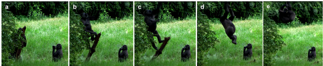
Fig. 2 Behavioural sequence associated with Observation 4. The adult female named Gyasi (on the left) a erected a wooden log under the oak branch while firmly grabbing it with both hands, b climbed

onto it while looking at the branch, c jumped toward the branch, d grabbed it with both hands, and e climbed onto the oak tree to get access to fresh leaves