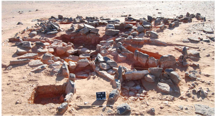
FIGURE 5 Qulban Beni Murra north Jabal at-Tubaiq, southeastern badia . Canal-type trough system fed by a well typical for the pastoral Rajajil Cultures (late fifth millennium BCE). (Eastern Jafr Archaeological Project; plan: C. Purschwitz) [Colour figure can be viewed at wileyonlinelibrary.com ]