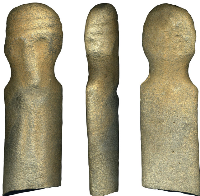
FIGURE 1 Wadi Sahab al-Asmar 8 north of Jabal at-Tubaiq, southeastern badia . Human representation (height: 35 cm, columnar basalt) found in the rubble of multi-chambered D-shaped cairn of the Rajajil Cultures (either late fifth/early fourth millennium BCE or—for its stylistic features—“recycled” Neolithic statue). (Eastern Jafr Archaeological Project; photo: H. G. K. Gebel) [Colour figure can be viewed at wileyonlinelibrary.com ]

The inland fringes beyond Arabia’s coastal strips, where rich marine sources allowed productive shell-fishing/fishing, as well as productive hunter-gatherer cultures in the semi-arid fringes of the Fertile Crescent’s settled zones, were contact areas with Arabia’s inland hunter-gatherers. For example, in the badia , recent research by Abu-Azizeh and by Rollefson et al. may show evidence for such contacts with indigenous foraging cultures (Abu-Azizeh, 2019, Abu-Azizeh et al., forthcoming; Rollefson, Rowan, & Wasse, 2014: 299).