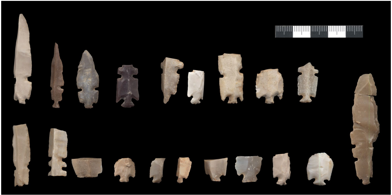
FIGURE 2 ‘Ainab 1, Structure A, close to Jabal ‘Ainab, southeastern badia : Helwan points from an EPPNB megalithic hunting camp hosting a bidirectional primary production: Just representing a techno-stylistic incursion? (second half of the ninth millennium BCE). (Eastern Jafr Archaeological Project; photo: C. Purschwitz) [Colour figure can be viewed at wileyonlinelibrary.com ]