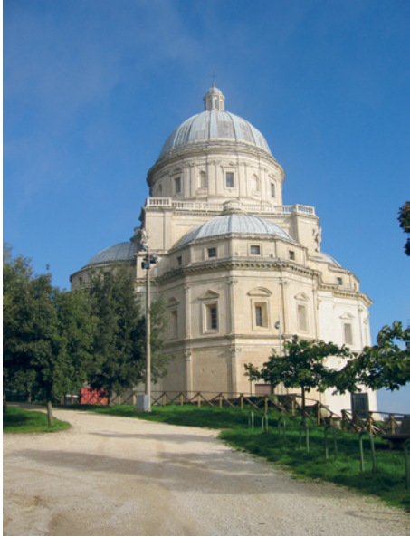
Fig. 2. Santa Maria delle Carceri, Prato.