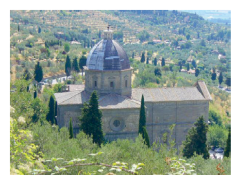
Fig. 1: Santa Maria delle Grazie al Calcinaio, near Cortona.

structure, is immediately apparent in the fact that the hitherto ever-present side aisles were eliminated in order to express this unity. Thus the observer is immediately swept to the centre, where the brilliant light of the sky pours in through the 8 clear glass (as opposed to stained glass) windows of the dome's lantern and drum, totalling 16 windows. Because they were doubled, the number of the 8 dividing pilasters of the dome's drum also totalled 16. According to ancient Pythagorean numerical theory well known in the Renaissance, 8 was the embracer of all harmonies because its relation to 2 and 4 made it the first number to be "equal times equal." As for the number 16, it signified the perfect temple, according to Alberti's ancient Roman mentor Vitruvius, who, like Alberti, was an admirer of Pythagoras. Thus, in terms of its numerical harmony, the conflation of the cube (22 \times 2 = 8) , the square (4 \times 4 = 16) , and the circle of the dome, all contained within this singular structure, suggest the ultimate Monad, or the perfection of God himself. This early experiment reveals the architect's struggle to conceptualize the dome in perfect proportion with the unified arms of the body of the church.