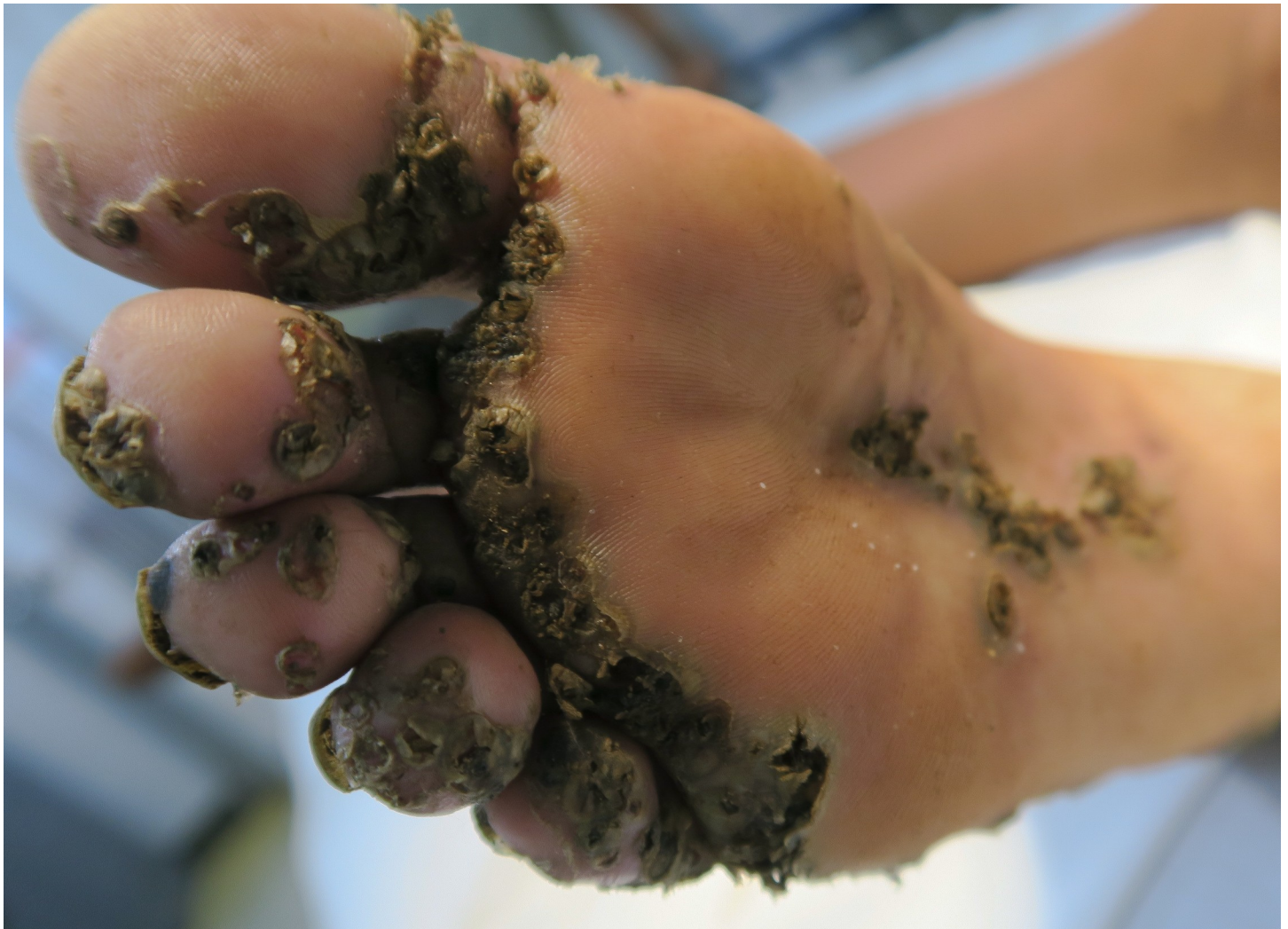
Fig 7. A cluster of embedded sand fleas at the sole below the toes and the interdigital area.

https://doi.org/10.1371/journal.pntd.0007068.g007