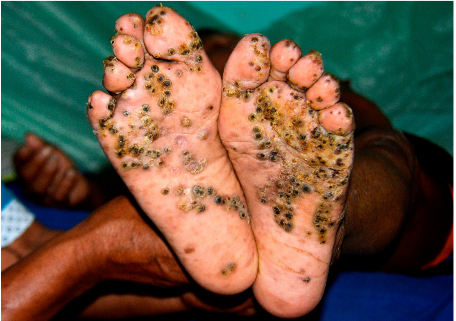
Fig 8. Soles one week after the first application of dimeticone. Parasites have died, the inflammation has decreased, and the skin has started to heal.

https://doi.org/10.1371/journal.pntd.0007068.g008