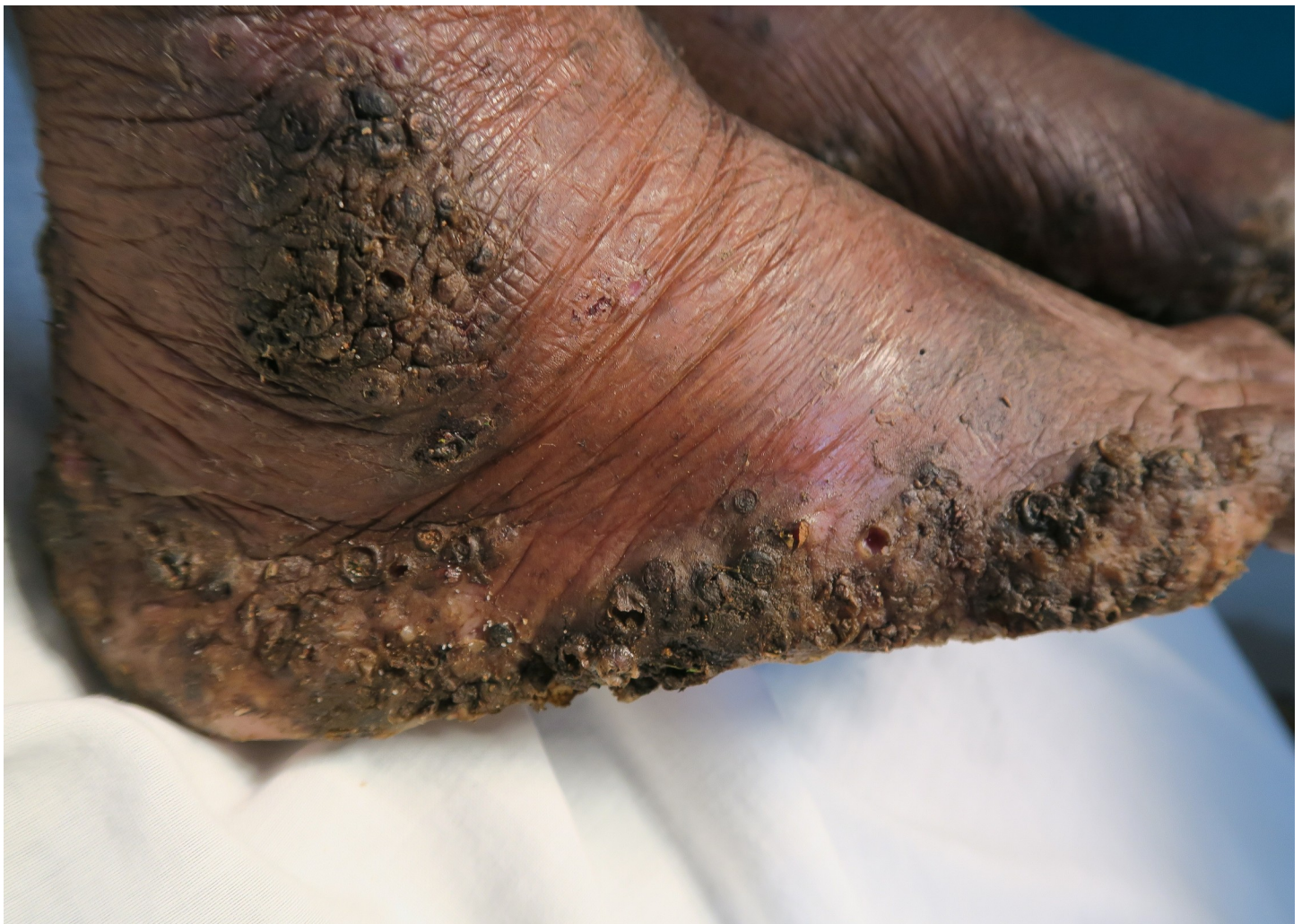
Fig 2. Lateral rim of right foot of the same patient as in Fig 1. Several layers of embedded sand fleas are located on top of each other. A larger cluster of parasites is located at the ankle.

This case series shows that very severe tungiasis still occurs, but goes unnoticed by health care providers because the patients are living in remote settings in the hinterland and do not have access to health care. The short period in which the five patients were identified indicates that very severe tungiasis is expected to occur in many Amerindian communities. Although