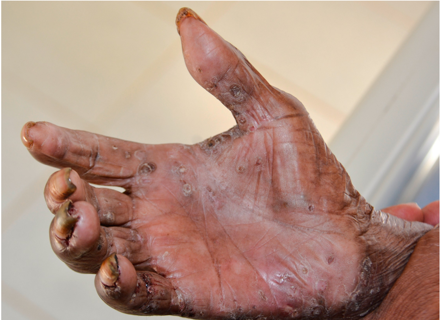
Fig 6. Ectopic localization of embedded sand fleas in the palm of the hand.

https://doi.org/10.1371/journal.pntd.0007068.g006