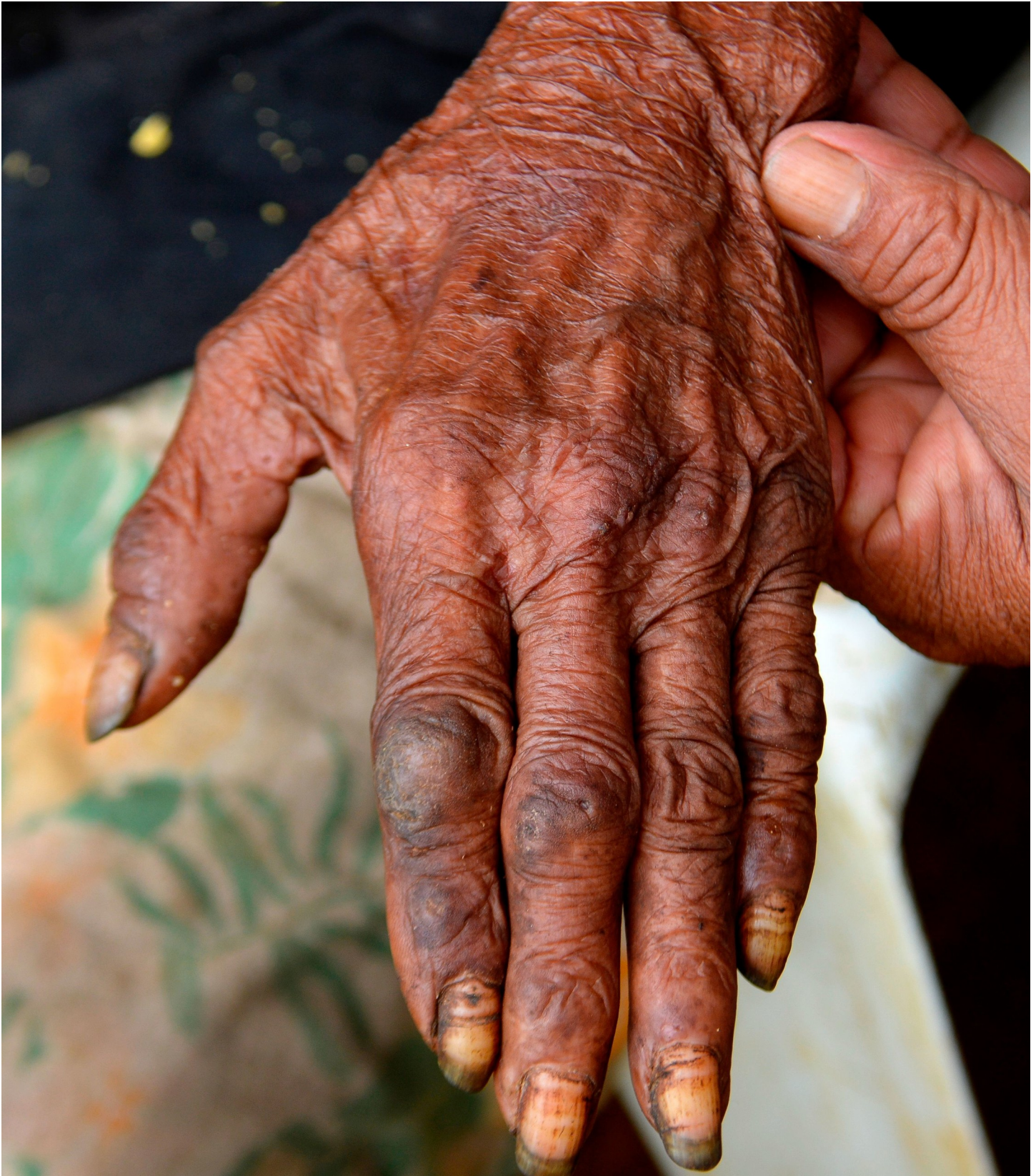
Fig 5. Ectopic localization of embedded sand fleas on the back of the hand.

https://doi.org/10.1371/journal.pntd.0007068.g005