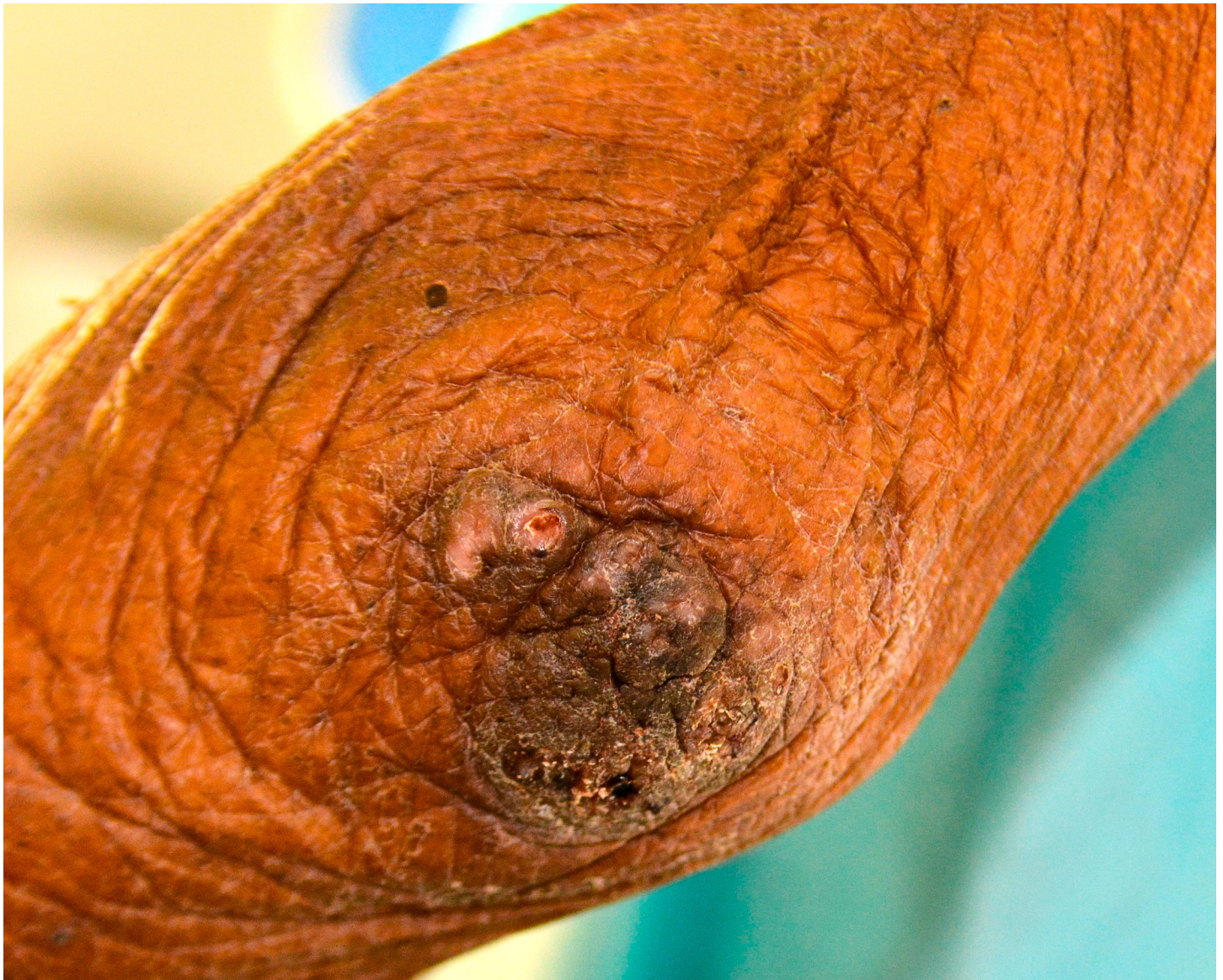
Fig 4. A cluster of embedded sand fleas at the elbow.

https://doi.org/10.1371/journal.pntd.0007068.g004