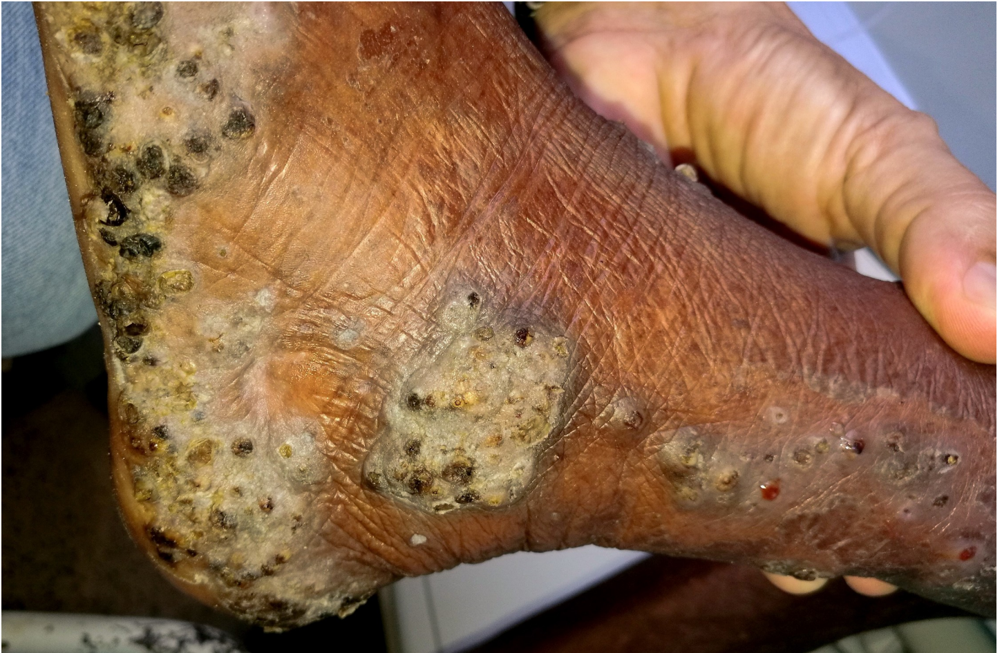
Fig 3. Clusters of embedded sand fleas at the ankle and the lateral side of the lower leg.

https://doi.org/10.1371/journal.pntd.0007068.g003