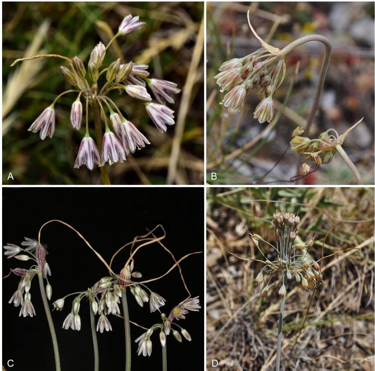
Fig. 1. Inflorescences – A: Allium oreohellenicum from S Pindos (Mt Kakarditsa, 6 Aug 2017, photograph by I. Kofinas); B: A. frigidum from Peloponnisos (Mt Panachaikon, 24 Jul 2014, photograph by D. Tzanoudakis); C: A. parnassicum from Sterea Ellas (Mt Parnassos, 28 Jul 2015, photograph by P. Trigas); D: A. flavum subsp. tauricum from Peloponnisos (Mt Klokos, 11 Jul 2017, photograph by D. Tzanoudakis). – The last (D) erroneously considered by Bogdanović & al (2011) as the “true A. achaium ”.

Stearn (1978, 1980, 1981) and Kollmann (1984: 135). On the contrary, A. achaium has been subsequently reappraised as a distinct species of the Greek flora by Andersson (1991: 709), with the Orphanides gathering from Mt Klokos in G-BOISS as the holotype of the species and its total distribution range indicated from Peloponnisos to the mountains of Sterea Ellas and Southern and Northern Pindos (Thessalia/Ipiros).