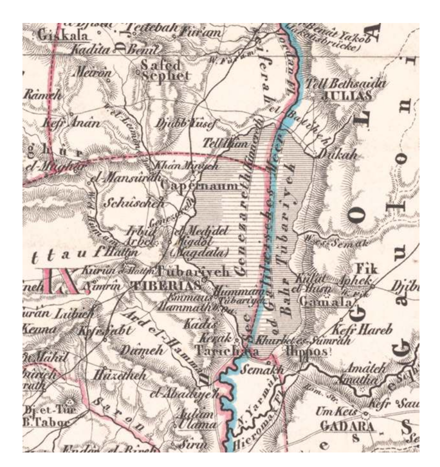
Fig. 7 Kiepert's cartography of the Sea of Galilee.