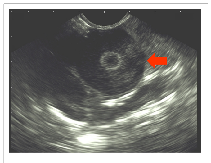
FIGURE 2 | Sonogram of the ovary of a hen. The arrow marks an ovarian follicle.