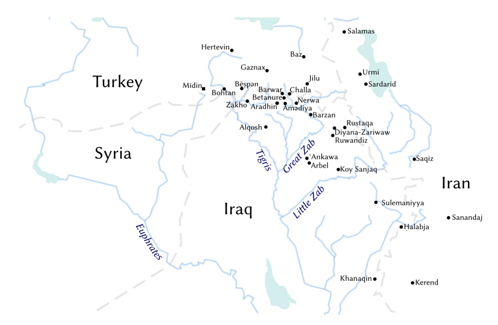
Figure 1.1: Approximate locations of NENA dialects (and one NWNA dialect: Mīdin ) at the beginning of the 20<sup>th</sup> century.

collected as well, but for methodological reasons are not treated in the book.