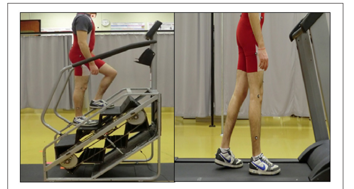
FIGURE 1 | Pictures showing experimental set-up with the participant walking on stairmill (left) and treadmill (right).

Before collecting the data, participants selected their preferred stepping rate (PSR) to perform continuous stair-climbing without using handrails. The PSR was confirmed by increasing the stepping rate until the participant reported discomfort with further increase. Then the stepping rate was decreased until the participant asked to increase the stepping rate. This was repeated until the participant reported a comfortable stepping rate which was used as a PSR. The participants were blinded from the numerical value of the stepping rate that was displayed on the stairmill. Each participant was given 1 min to familiarize themselves stepping at their PSR. Data collection began after at least 2 min of rest post-familiarization. Data were collected in three conditions for 3 min each: PSR, fast stepping rate (110%PSR) and very fast stepping rate (120%PSR). The order of the conditions was randomized. A resting period of at least 3 min was provided between each testing condition. After collecting data on the stairmill and sufficient rest, the preferred walking speed (PWS) on the treadmill was determined by repeatedly increasing and decreasing the walking speed above and below the speed that the participant reported as comfortable. Following another rest period, participants performed a 5 min walking trial at PWS, which in average was 1.19 (0.24) m/s.