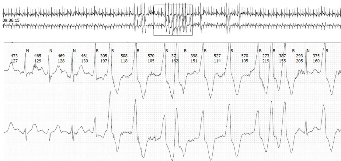
Figure 1 Non-sustained ventricular tachycardia in a well-trained 48-year-old male endurance runner without cardiovascular risk factors despite smoking.

according to pre-defined criteria was found in 16.8% (n=18) of all participants. In univariate analysis, advanced age (p=0.004) and a longer marathon finishing time (p=0.009) were associated with abnormal ECG findings, while sex, cardiovascular risk profile, haematocrit post-race and the number of previous marathons were not. In multivariate analysis, advanced age remained significant (OR 1.11 per year, 95% CI 1.01 to 1.23) (table 2). In addition, athletes with an abnormal ECG had a higher frequency of PVCs (median 3.0 (IQR 1.0 to 12.3) vs 23.5 (IQR 10.0 to 44.0), p<0.001) during the marathon race.