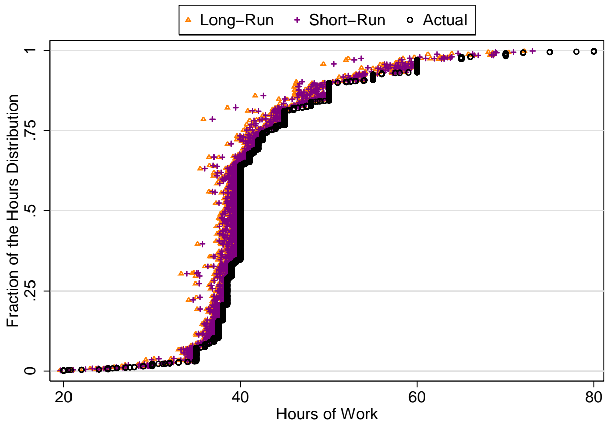
Figure 3: Reduction in Hours of Work

Notes: Small circles indicate the percentile rank of individual i in the actual observed distribution of hours of work (vertical axis) and the actual hours of work (horizontal axis) in 2011. Triangles maintain the percentile ranking from the observed distribution and indicate the simulated short-run value of the hours of work when \sigma_{w,it} is set to \sigma_{w,it}^{\min} . Plus symbols denote the respective long-run hours of work when \sigma_{w,it} is set to \sigma_{w,it}^{\min} .