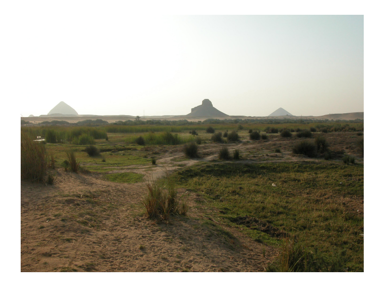
Fig. 1 | The Pyramids of Dahshur are visible from a great distance (here 2.5km).

The construction of a pyramid complex was the main building project of a king in the Old Kingdom (about 2650–2150 BCE). All pyramids were erected at the Western Desert escarpment within a maximum distance of about 25km opposite the former capital of Memphis.<sup>1</sup> Due to their size and their location on the Egyptian Limestone Plateau, these monuments could be seen over vast distances. By means of their monuments, the socially distant god-kings of Ancient Egypt were always visually present. Thus, the political structure was translated into architectural forms and mapped onto the landscape.<sup>2</sup>