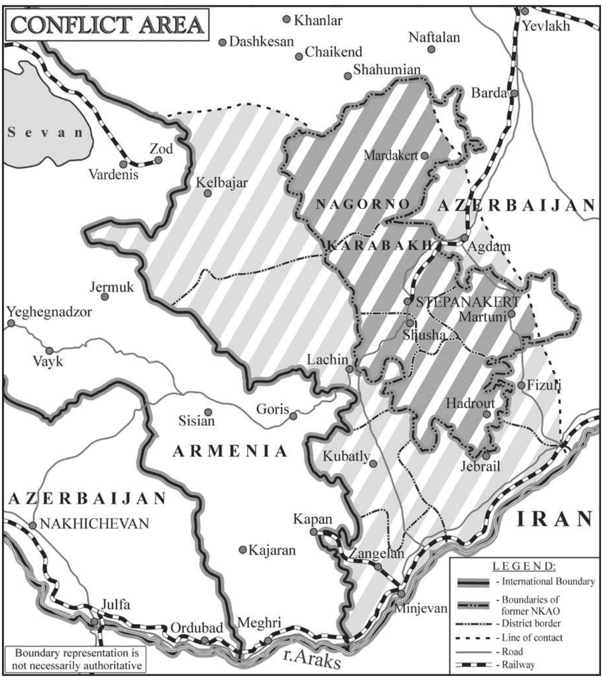
Source: International Crisis Group 2011: Armenia and Azerbaijan: Preventing War, Europe Briefing N° 60, Tbilisi: International Crisis Group.