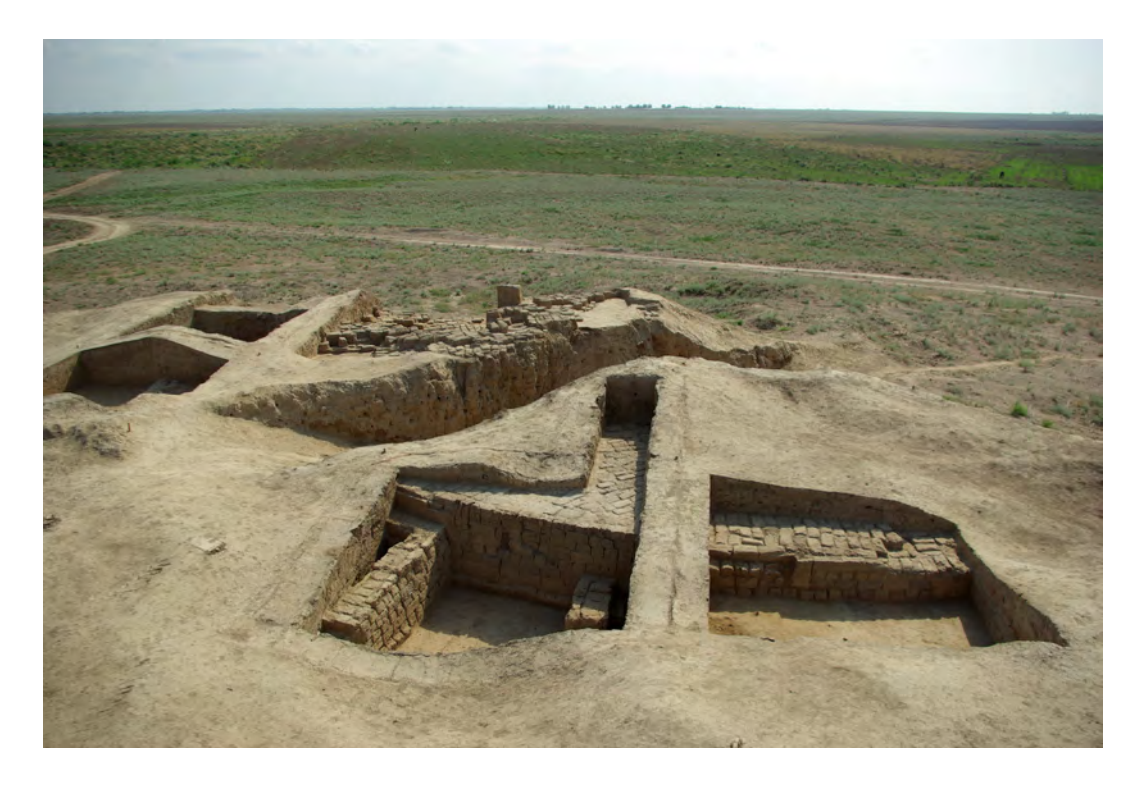
Fig. 2 | The massive mud brick platform of Kamiltepe.

building a massive sub-circular platform (Fig. 2).<sup>10</sup> Unfortunately, the upper part of this mud brick construction no longer existed prior to the beginning of excavation in 2009 but, on the basis of the micromorphological analysis of thin sections, it can be assumed that one or more built structures made of mud and vegetal materials had been erected on top of it.<sup>11</sup> Located in the rather flat landscape of the lower Kara Çay Valley, Kamiltepe was a monumental landmark visible from a distance. For multi-sited, highly mobile groups with loose physical borders, Kamiltepe might have acted as an anchoring place to which the 6th millennium BCE communities felt attached and where they gathered to perform communal rituals. The latter might have also included commensal events or 'feasting,'12 as suggested by large quantities of bones of domesticated and wild animals recovered in several dumping ashy layers around the platform.<sup>13</sup> The variety of ceramic vessels used for eating and drinking<sup>14</sup> as well as the botanical remains<sup>15</sup> and use-wear analysis on stone tools<sup>16</sup> found in these contexts also provide evidence for intense and varied activities of food preparation and cooking directly linked to practices of food consumption. These forms of recurrent community social anchoring practices might have tightened up relations among dispersed but integrated small social groups.<sup>17</sup>