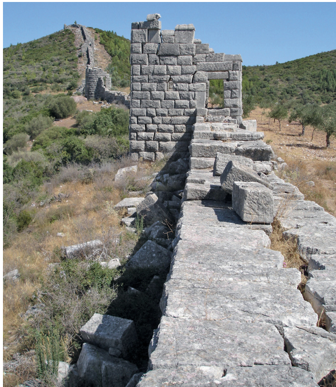
Fig. 1 | Messene city wall, north-western section (view from south).