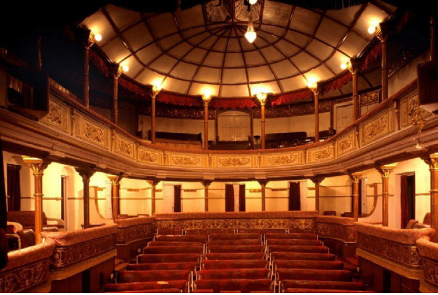
Fig. 3. The auditorium of the Gaiety Theatre in Simla as it is today after two decades of restoration.