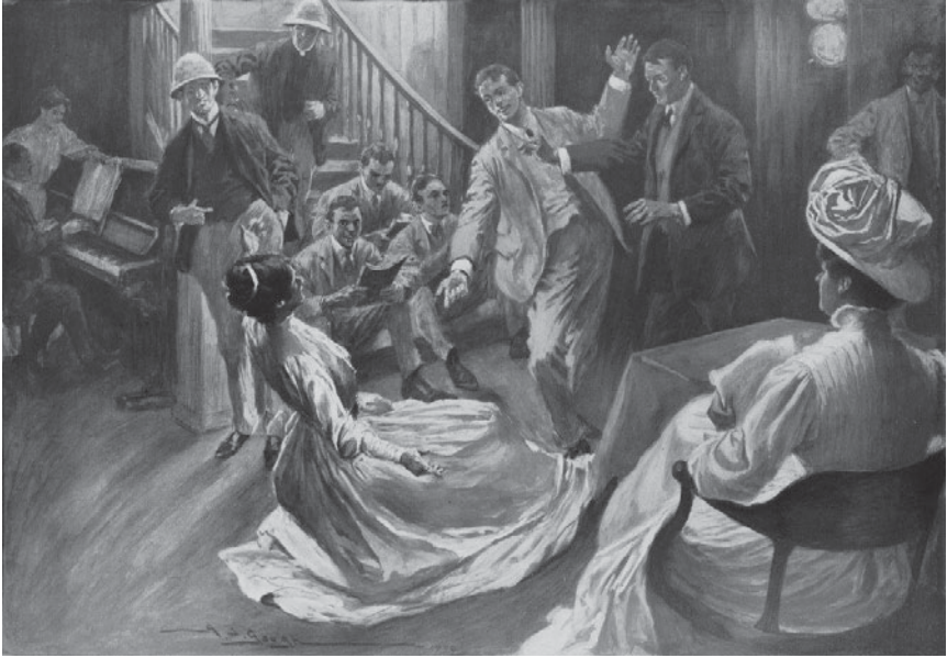
Fig. 1. Musical comedy rehearsal aboard ship. 'The subject of this picture is a rehearsal of a musical comedy on board a P. and O. boat bound for China. Although the passengers regard the scene as a form of amusement for them, the artists find it hard work, and are often glad when the weather is too rough for rehearsals to be held.'