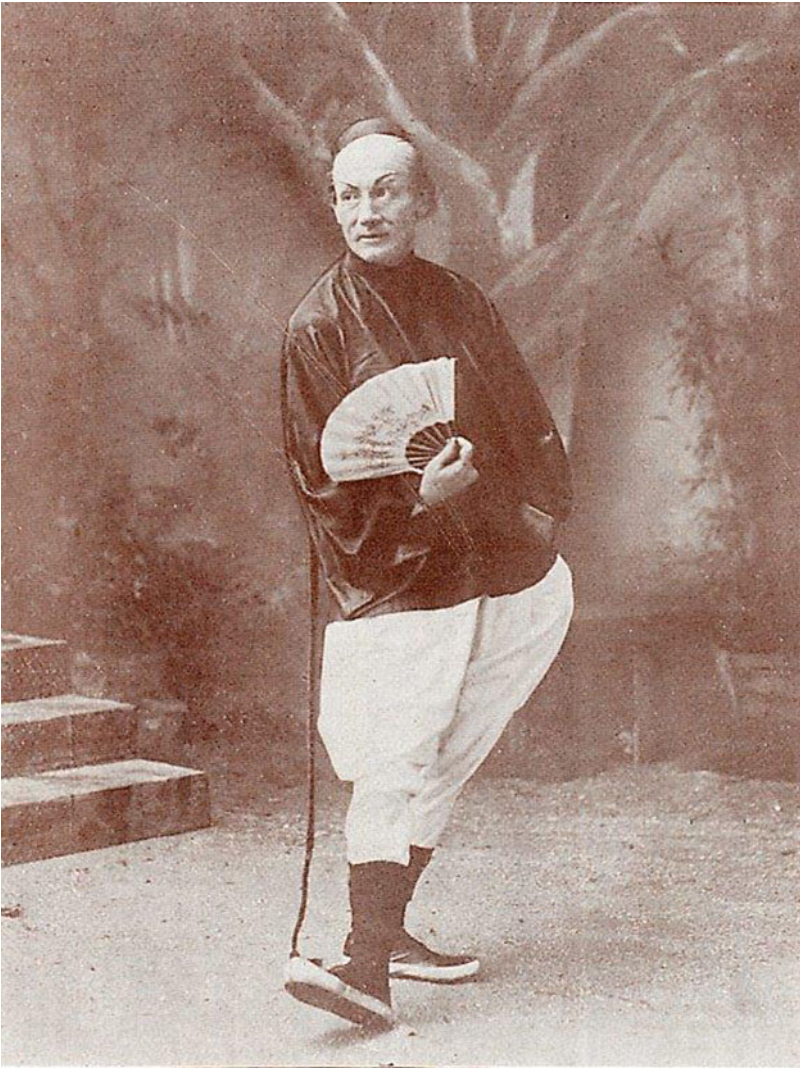
Fig. 4. Robert Baden-Powell as Wun Hi in an 1897 performance of the musical comedy The Geisha by the Amateur Dramatic Club of Simla.

Source: Edward J. Buck, Simla, past and present (Calcutta, 1904), pp. 144–5 (courtesy of the Staatsbibliothek Berlin, Bildarchiv Preußischer Kulturbesitz).