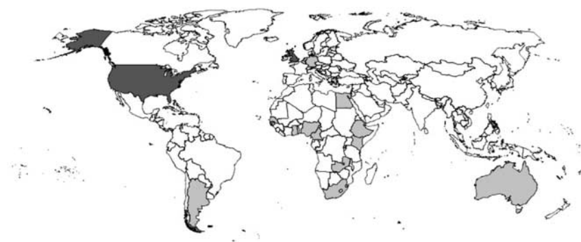
Figure 2 Countries where Climate Change Impact Assessment (CCIA) on dairy farming has been carried out; white: no study, light grey: one study, dark grey: two and more studies. Source: own illustration based on Martinsohn and Hansen (2012).

or more dangerous pathogens in the course of climate change can have significant indirect impacts on dairy farming.