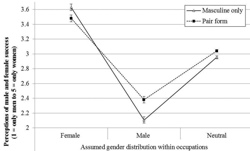
FIGURE 1 | Mean perceptions of success for men and women in occupations with different gender distributions (scale from 1 = only men to 5 = only women).