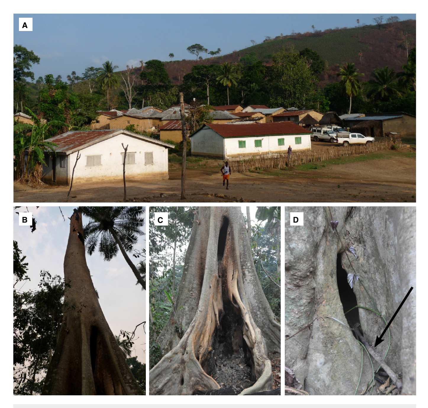
Figure 3. Meliandou and the burnt tree that housed a bat colony. A The village of Meliandou.

B–D The burnt hollow tree; in (D), the arrow points at a stick, most probably left there by children.