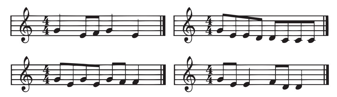
FIGURE 2: Overview of the stimuli (nursery rhymes) used in the melody recognition task. The stimuli were the nursery rhymes "Hänsel und Gretel" (first row, left), "Der Kuckuck und der Esel" (second row, left), "Weil heute Dein Geburtstag ist" (first row, right), and "Hänschen klein" (second row, right). These stimuli were known to all children.

Children sat in front of a laptop with two external speakers and listened to the stimuli. Before the experiment, children listened to the beginnings of the nursery rhymes four to six times and sang it two to four times with the experimenter. All tasks of the experiment were integrated in a game: Children had to help a cuddly toy (Paul, the forgetful rabbit) who played musical phrases, but could not remember if he played it correctly or incorrectly. Then they voted using two different buttons, whether the phrase was correct (unmodified) or incorrect (modified). In the melody recognition experiment, they detected which nursery rhyme was played. They gave their response with buttons placed next two a two-by-two array containing pictures representing the four different songs used in this task (see right part of Figure 2).