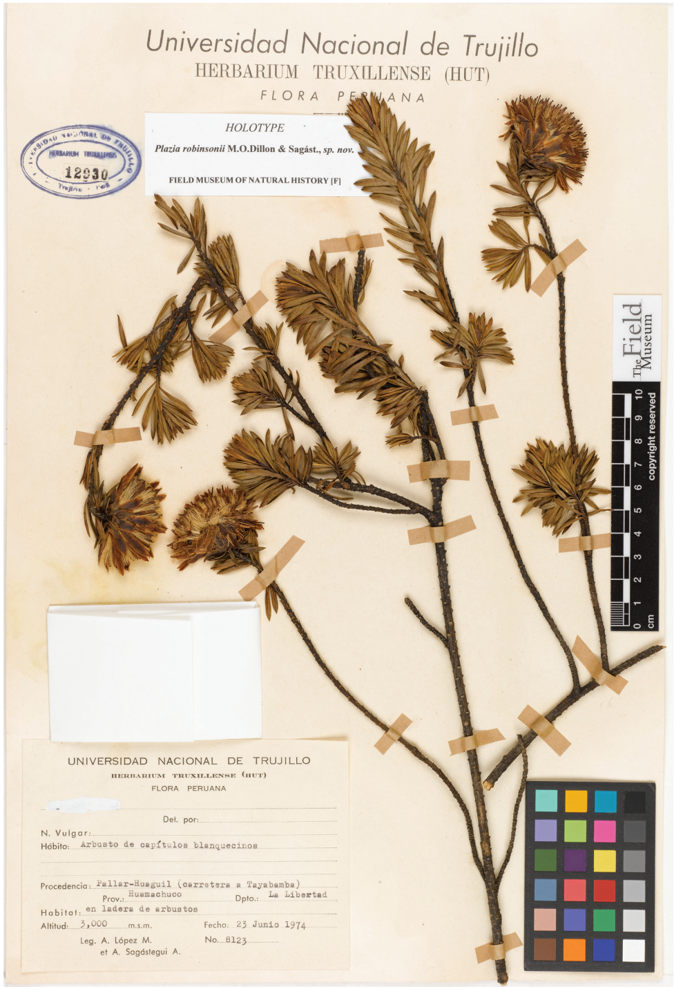
Figure 3. Plazia robinsonii M.O.Dillon & Sagást. Photograph of the holotype collection of A. López M. & A. Sagástegui A. 8123 (HUT).