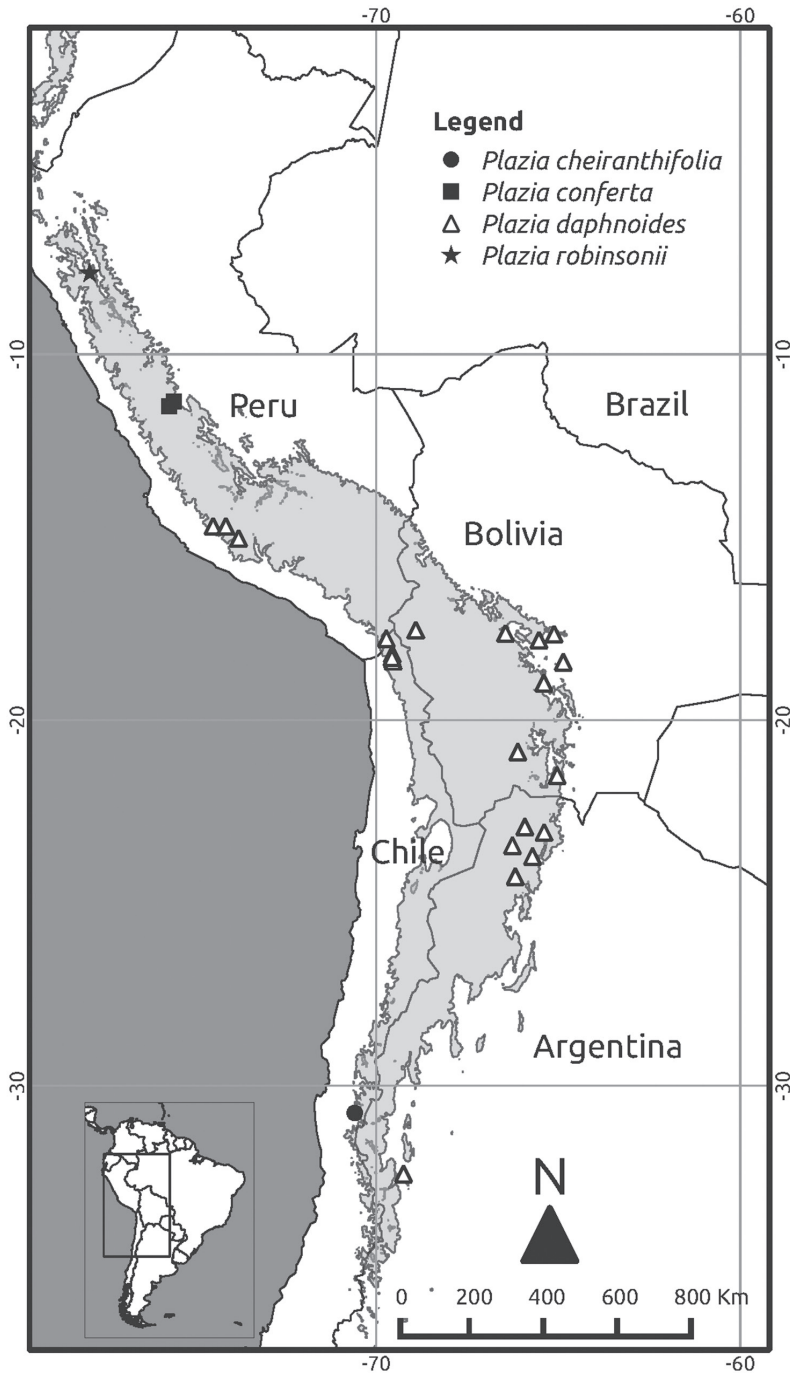
Figure 1. Distribution map of the currently recognized species of Plazia . The shaded area indicates high-elevation areas of the Andes above 3000 m. Locality data were obtained from Cabrera (1951), Ferreryra (1995), Missouri Botanical Garden ( http://www.tropicos.org/ ), Instituto de Botánica Darwinion (through http://www.gbif.org/ ) and the herbaria ASU, B, F, HUT, P, SGO, US.