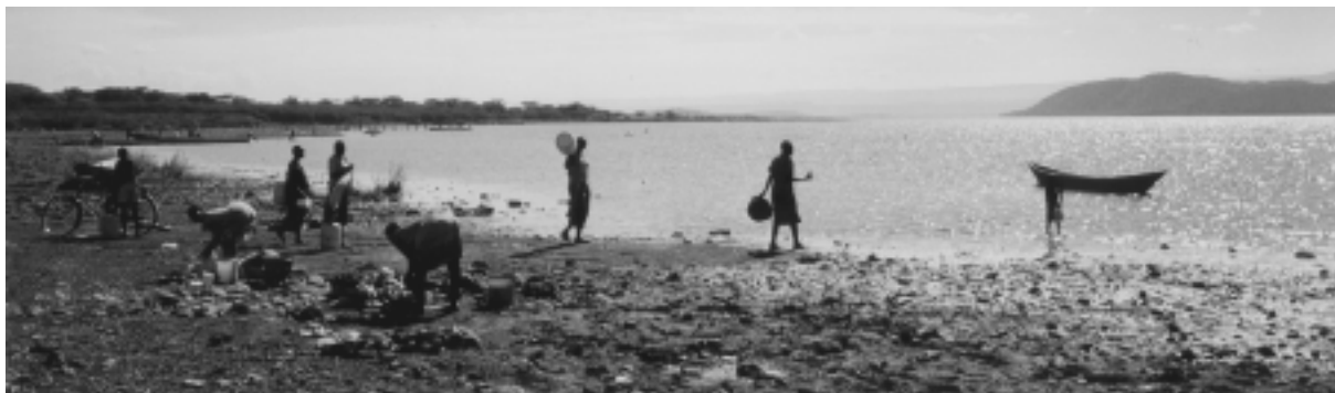
Fig. 1: Western shore of Lake Baringo near the village Kampi ya Samaki.

continuous low lake water levels and overfishing. Another important economical factor is tourism.