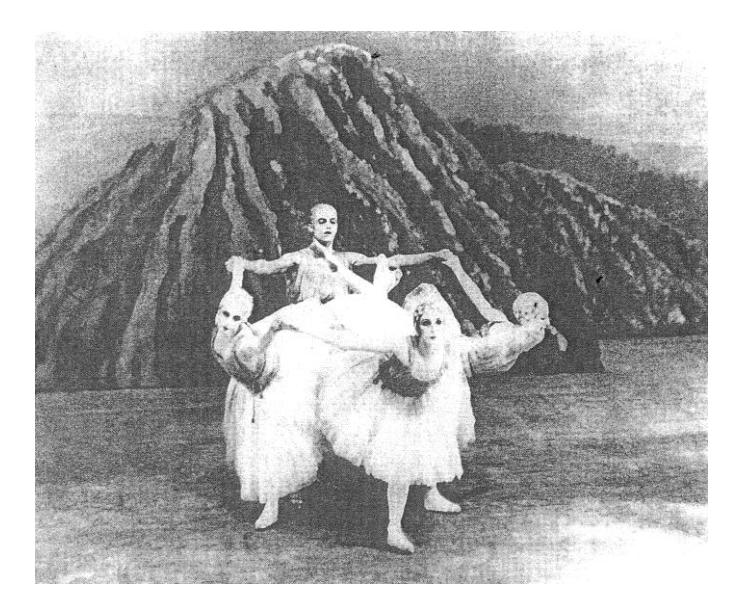
8. Apollon Musagète in 1928.