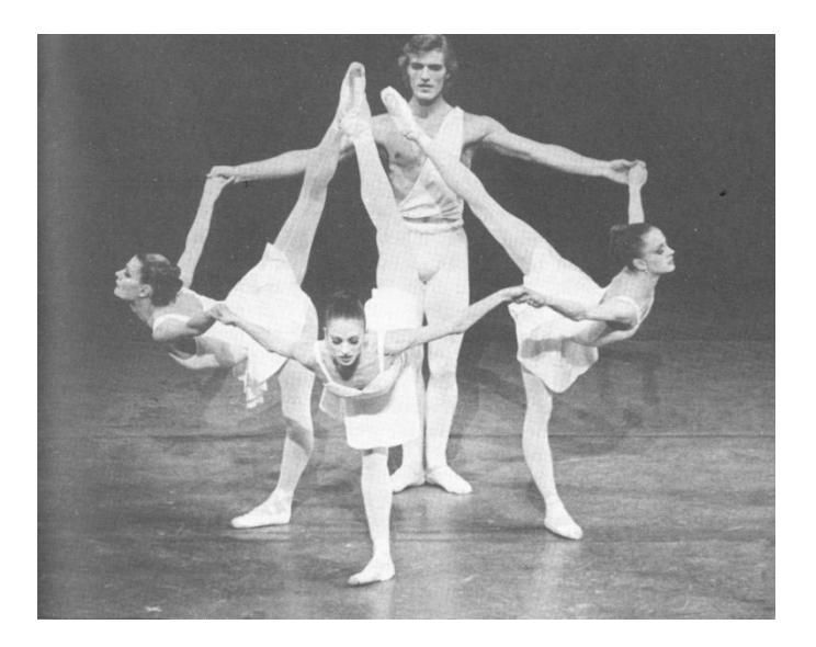
9. Apollo in 1982.

Three more important formations were created by the dancers near the end of the ballet. In one, all three Muses were sitting on one knee on the floor with the other leg extended forward, Apollo standing over them with his hand extended. In sequence, each dancer raised her foot to Apollo's hand until her toes touched his hand, and a structure was created that itself was three dimensional, but contained a two dimensional pyramid within it. In the next formation, one that was also in movement, the dancers created a chariot