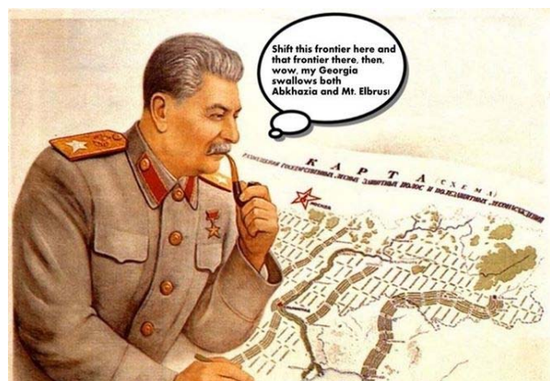
Cartoon illustrating Abkhaz stereotype