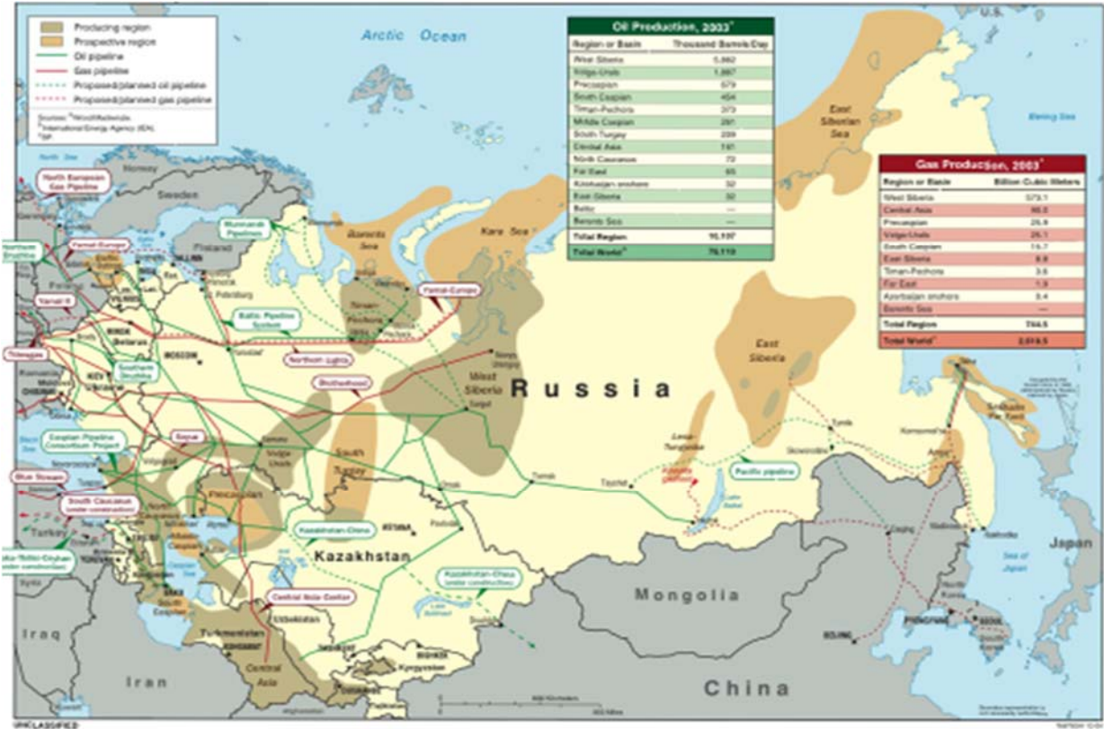
Selected Oil and Gas Pipeline Infrastructure in the former Soviet Union

corridor linking the EU to Caspian oil and gas while bypassing Russia.” 961 But energy dependency on Russia can hardly be listed as the only reason to diversify the EU’s energy supply. Unrest in the Near and Middle East, rising oil and gas prices partially as a result of the Afghanistan and Iraq wars, and an energy hungry rising China represent just a few additional considerations. Meanwhile, Stefan Meister tailors the concept of energy security to the South Caucasus: “The South Caucasus touches a number of European key energy routes, and is integrated in several Eastern policy initiatives including the European Neighborhood Policy, the eastern Partnership, and the European Black Sea Synergy. It is part of the Southern Energy Corridor and the Trans Caspian strategy. The Southern Corridor has become a priority energy project for Brussels, and is outlined in the Second Strategic Energy Review published in November 2008.” 962