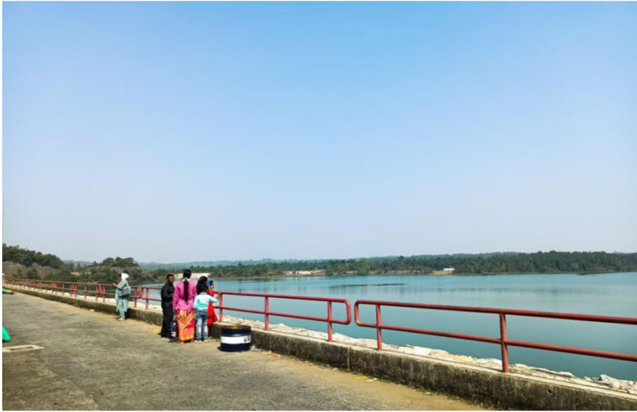
FIGURE A1 PPSP upper dam.