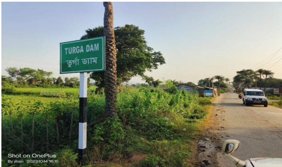
FIGURE A4 Nearby site of Turga dam (proposed).