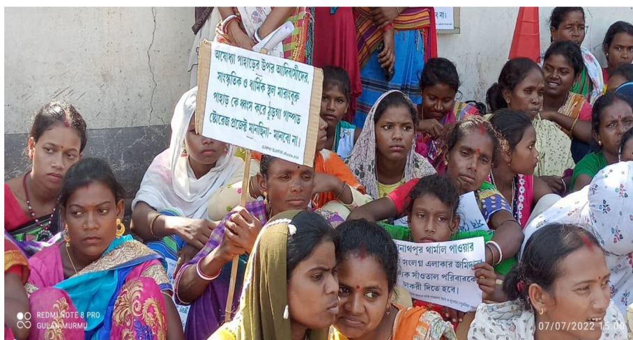
FIGURE A5 Protest against TPSP by indigenous women at Barujara Village at Ajothhya GP.