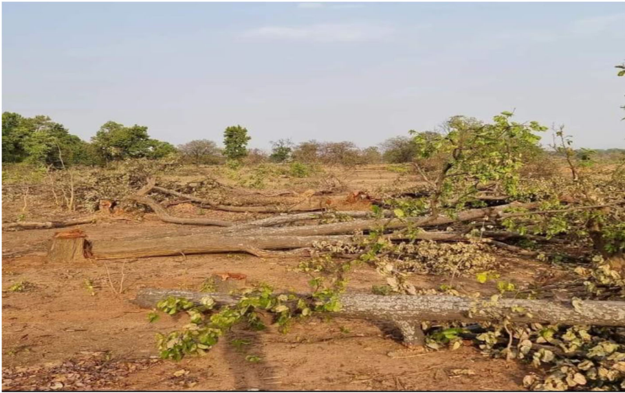
FIGURE A7 Deforestation at Ranga village in Ajodhya GP during the first phase of TPSP.