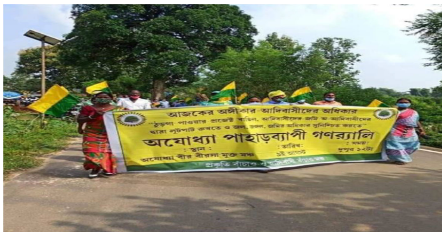
FIGURE A6 Mass protest against TPSP at Barria village at Bagmundi GP.