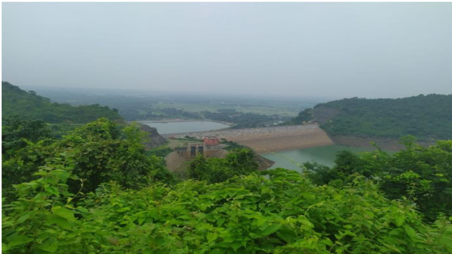
FIGURE A2 PPSP lower dam.