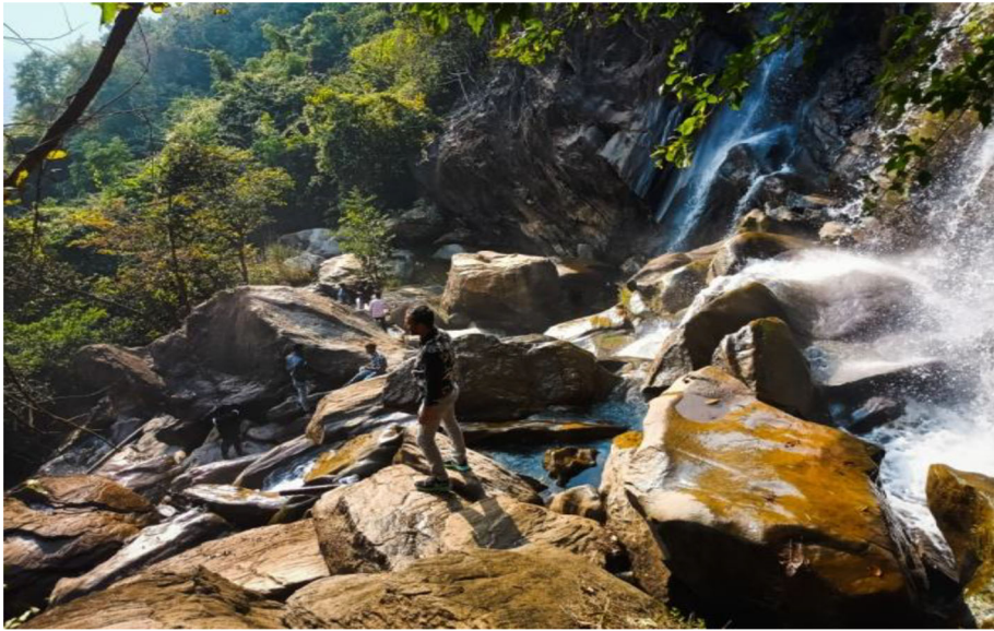
FIGURE A3 Turga falls at Ajyodhya.